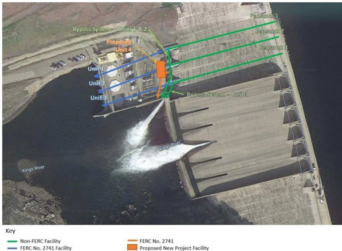
Figure A2. KRCD's Jeff L. Taylor Powerhouse Project Main Features (KRCD 2021)