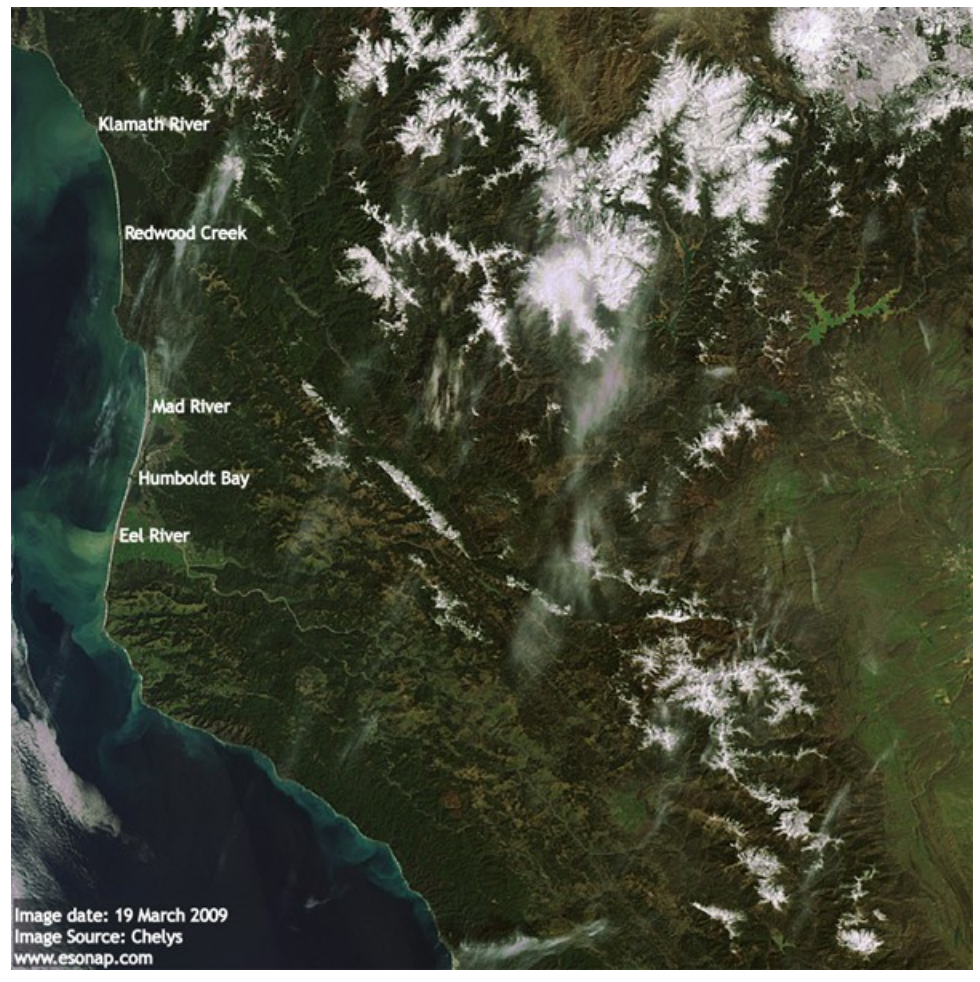
Figure E-4. River Plumes for Rivers in the Vicinity of the Klamath River during Typical Winter Conditions.

orders of magnitude from >1,000 mg/L to >10–100 mg/L. However, considering that dilution of high wintertime SSC loads occurs under existing conditions as well, the magnitude and extent of the sediment plume under the Proposed Project is likely to be greater than under existing conditions. This would potentially increase the rate of sediment deposition to nearshore benthic sediments. Overall, any spikes in SSCs associated with the Proposed Project are not anticipated to have effects on species distinguishable from existing conditions.