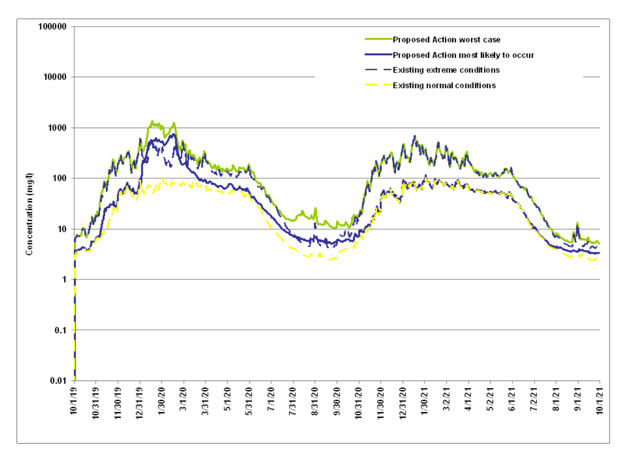
Figure E-3. Comparison of SSC at Klamath Station (RM 5) under Existing Conditions and the Proposed Project, as Predicted Using SRH-1D Model.