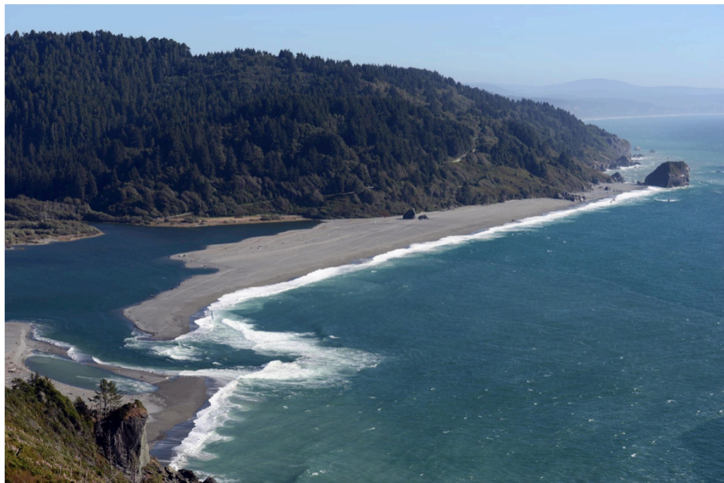
Figure 2 - Tonnage of Debris at Mouth of Klamath