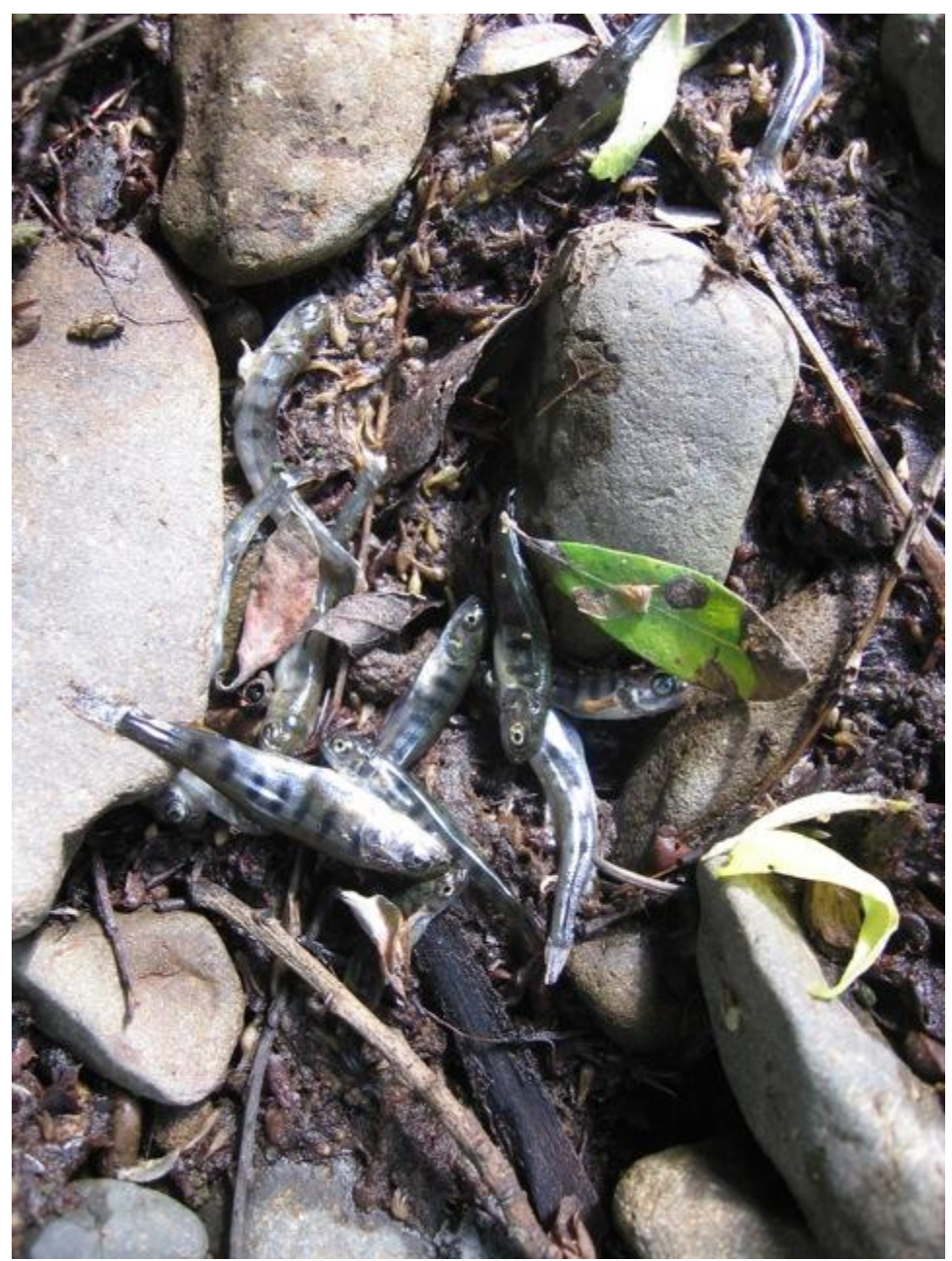
(Stream flows depleted by frost protection water use.)