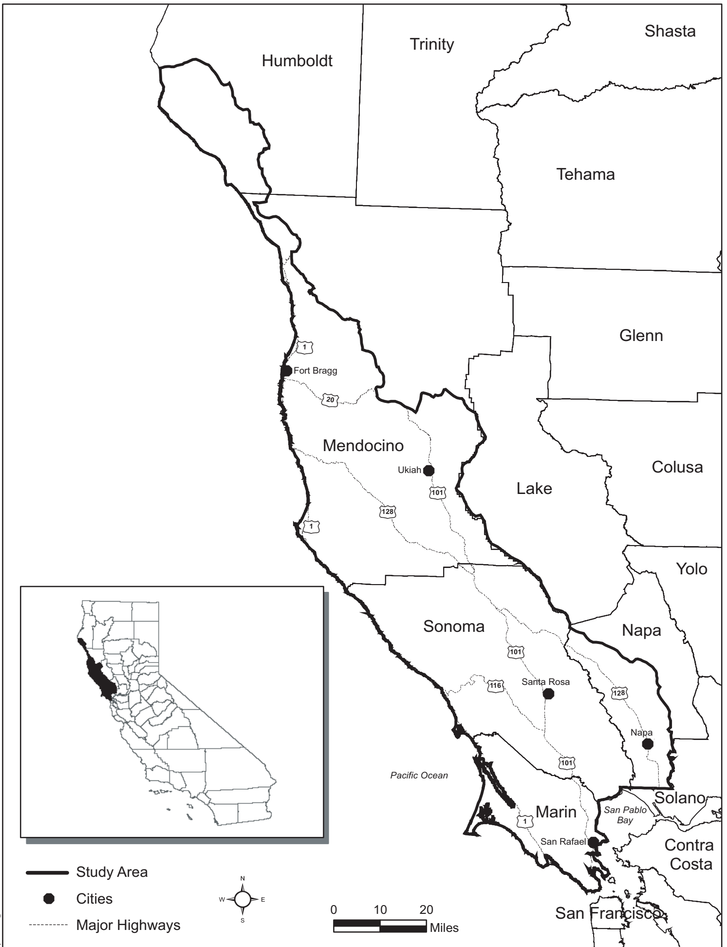
Figure 1 Project Location/Policy Area