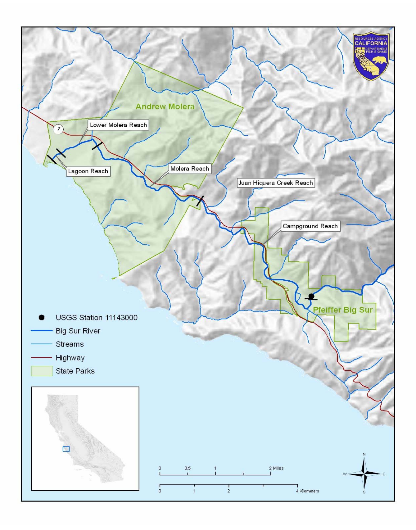
Figure 1. Map of Big Sur River showing flow study reaches.