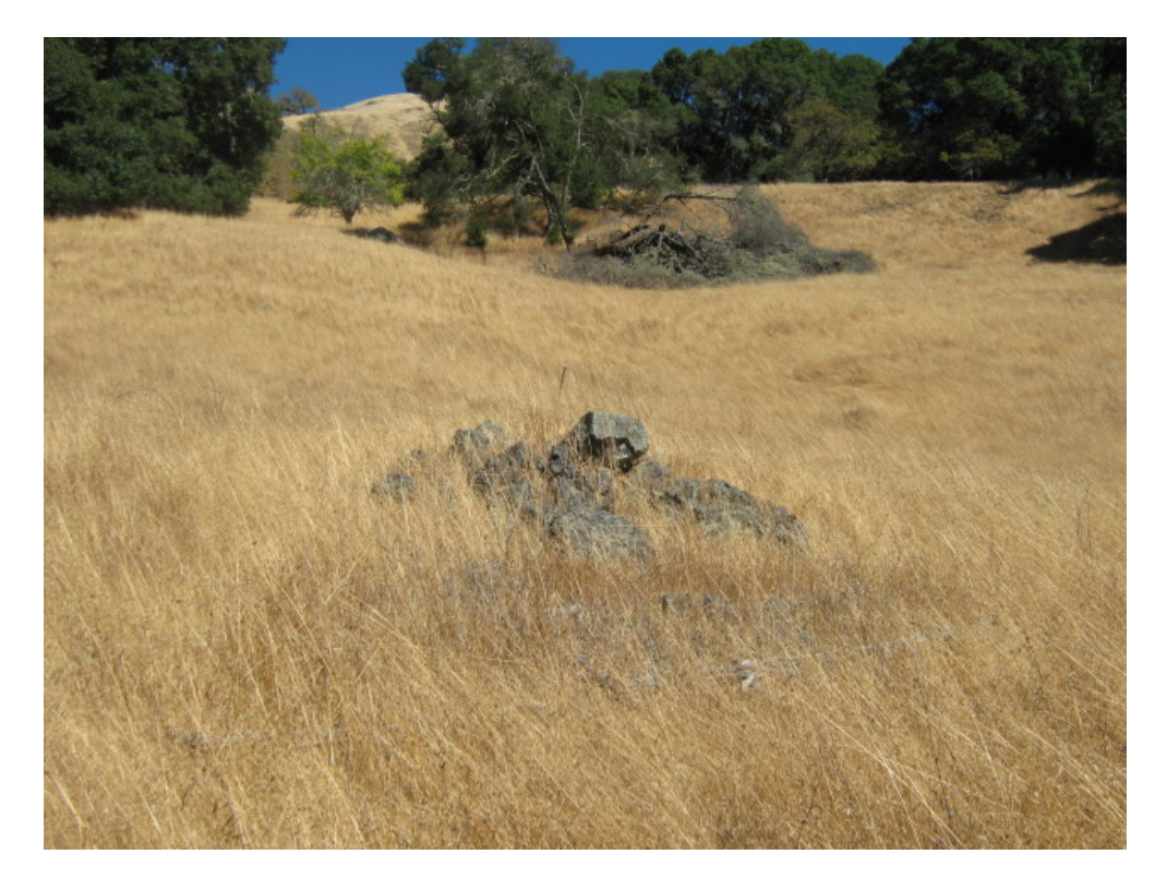
LOCATION OF UPPER SPRING