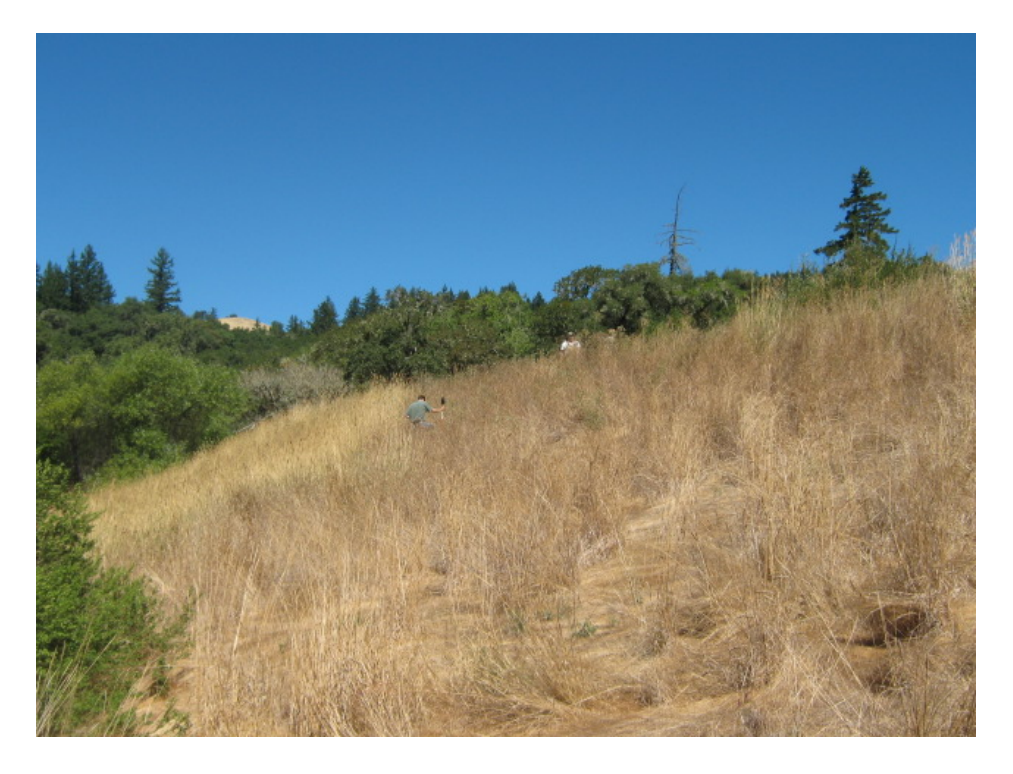
RESERVOIR #1 DAM LOOKING NORTHEAST