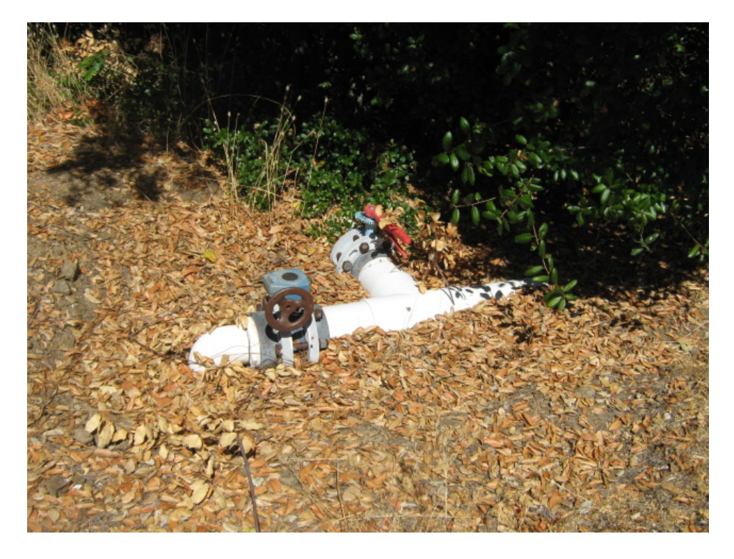
RESERVOIR #2 OUTLET PIPE & GRAVITY DIVERSION WORKS FOR VINEYARD IRRIGATION