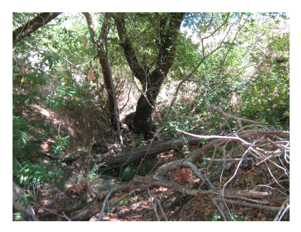
DOWNSTREAM CHANNEL LOOKING BACK TOWARDS RESERVOIR #1 DAM