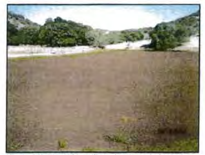
Figure 38: From the spillway looking northwest across the reservoir. It appears the grassy vegetation in the foreground is growing on top of the reservoir surface cover.