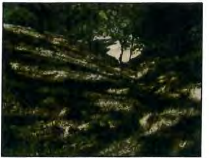
Figure 5: Defined channel as seen looking west downstream of Figure 4.