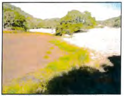
Figure 37: Eastern bank of the reservoir looking northwest as seen from spillway.