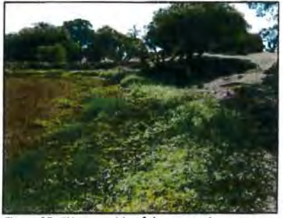
Figure 35: Western side of the reservoir as seen looking south.