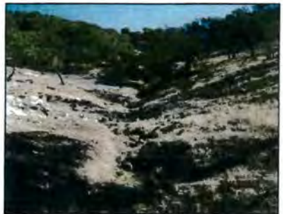
Figure 2: Defined channel as seen looking east.