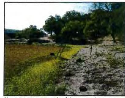
Figure 34: Western side of the reservoir as seen looking south.