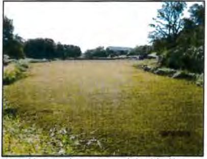
Figure 39: From the northeasterly bank looking south across the reservoir.