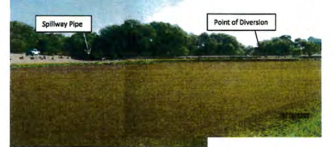
Figure 31: Spillway and point of diversion as seen looking southeast from the western bank of the reservoir.

Figure 30: Reservoir as seen from the southeast corner looking north. Earthen dam runs northeast along the right of the photo.