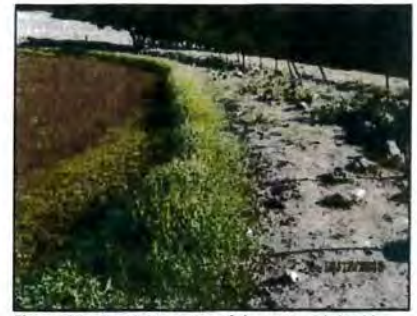
Figure 36: Southern point of the reservoir looking northeast along the dam.