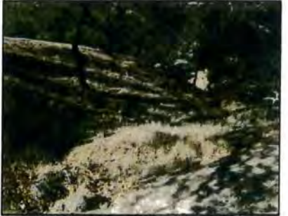
Figure 4: Defined channel as seen looking west from the cattle crossing in Figure 3.