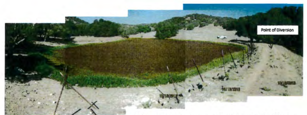
Figure 30: Reservoir as seen from the southeast corner looking north. Earthen dam runs northeast along the right of the photo.