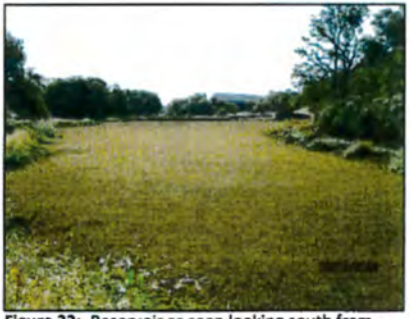
Figure 32: Reservoir as seen looking south from the northeastern bank of the reservoir.