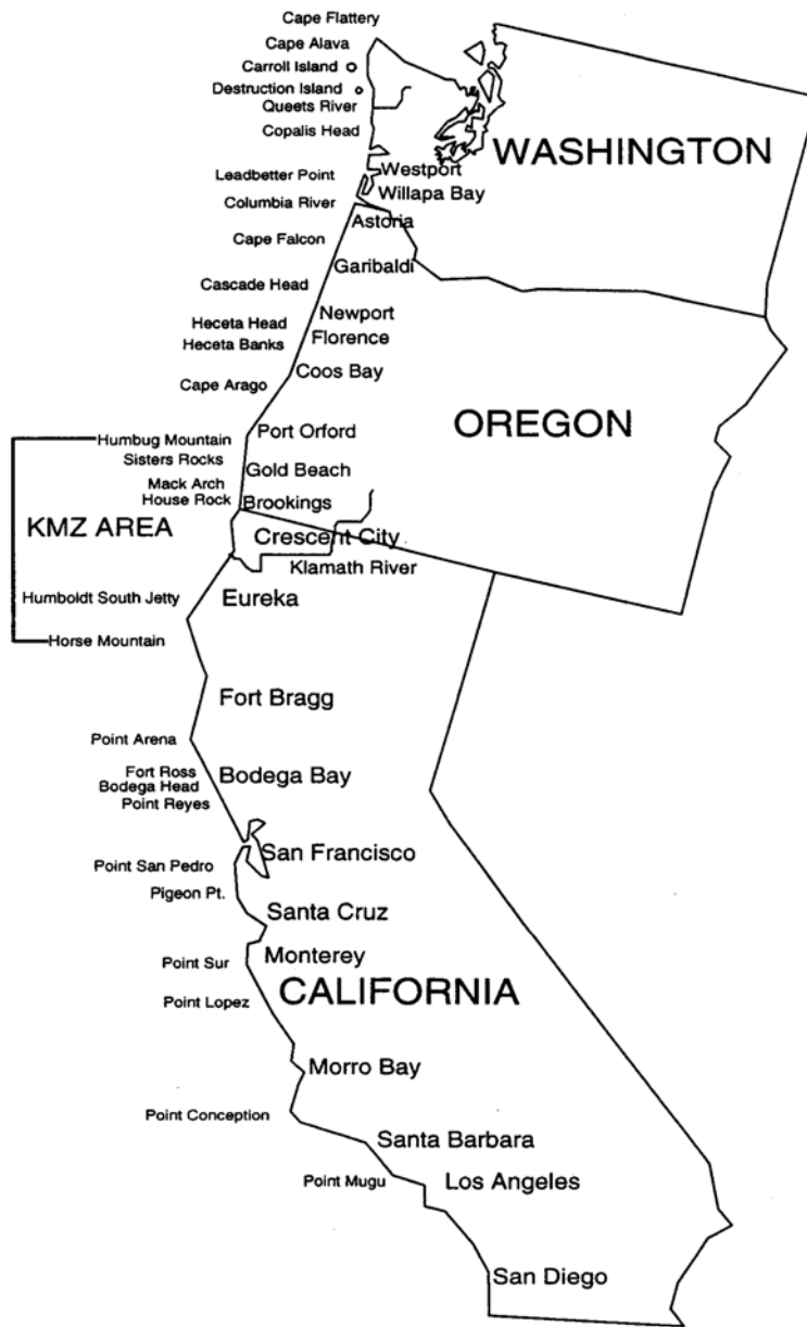
FIGURE 6-1. Management boundaries in common use during the early to mid- 1990's.