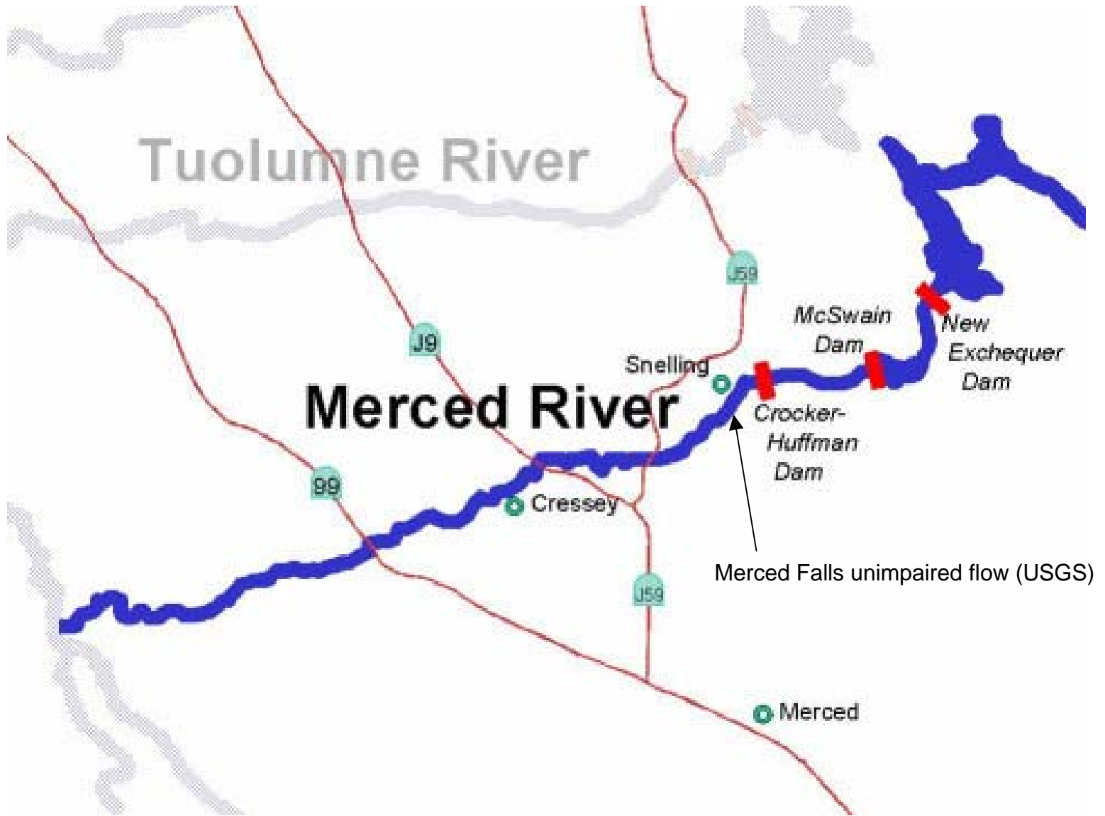
Figure 6. Map of the Merced River showing the location of the flow gauging stations.