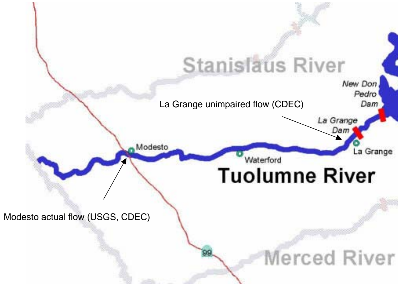
Figure 5. Map of the Tuolumne River showing the location of the flow gauging stations.