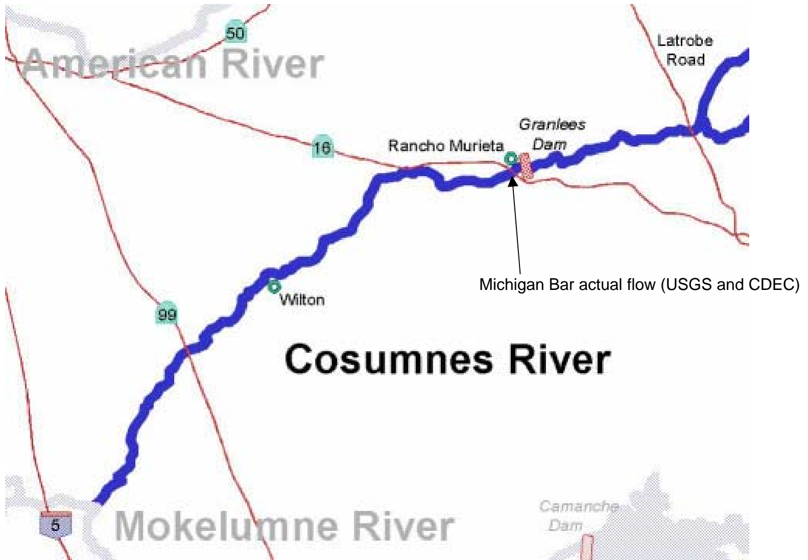
Figure 2. Map of the Cosumnes River showing the location of the flow gauging stations.