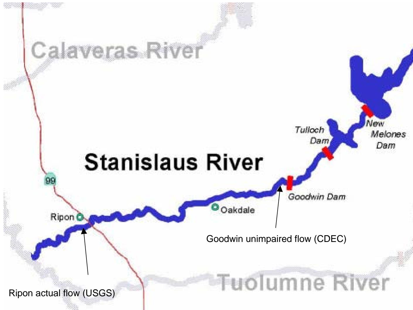
Figure 4. Map of the Stanislaus River showing the location of the flow gauging stations.