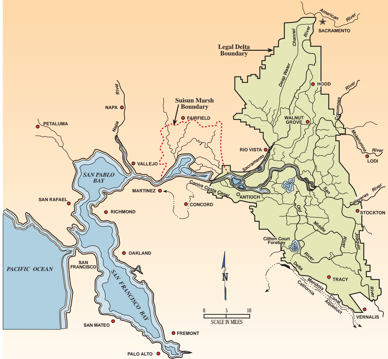
FIGURE 1 BAY-DELTA ESTUARY