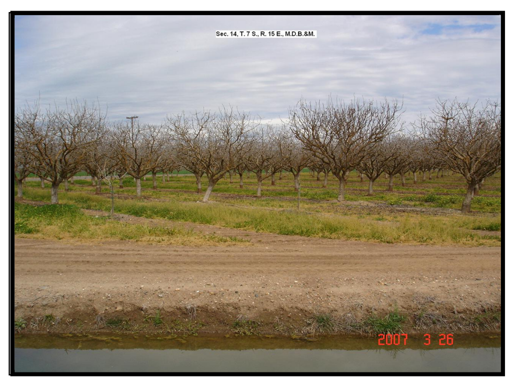
Views of typical irrigated lands within the proposed place of use for the Merced County SOI Water Users Association.

March 2007