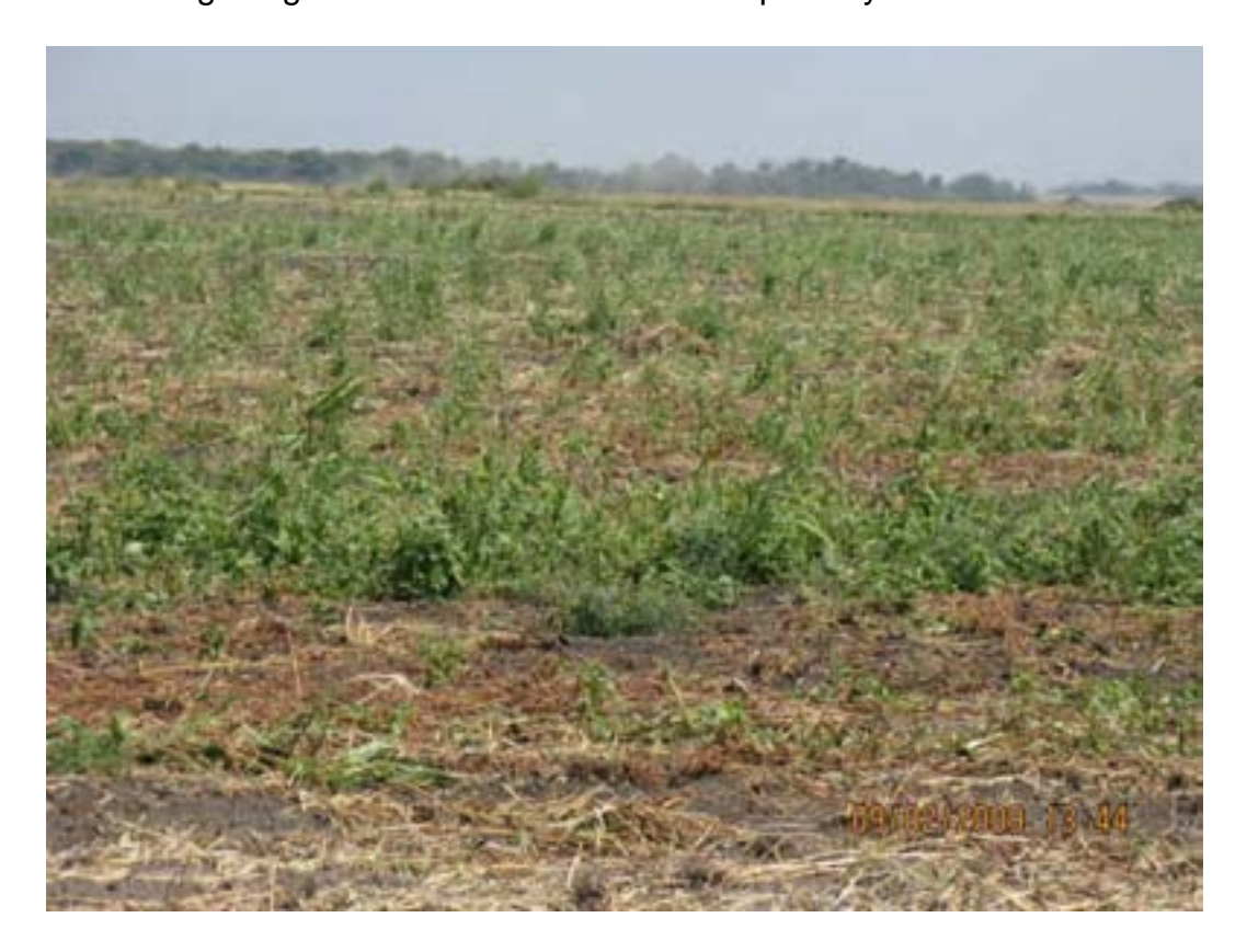
Also, in the fields containing Bermuda grass, much of the Bermuda grass was not uprooted, as in the portion of Field 101 that borders Field 79.

As stated in previous reports, the disking activity is not completely uprooting all the vegetation and residue which was not uprooted in a previous discing is able to regrow. Field 32 was disked last week but due to the poor disking the field was attributed today as FF-I1, indicating the field is fallow with enough vegetation to also be considered partially idle.