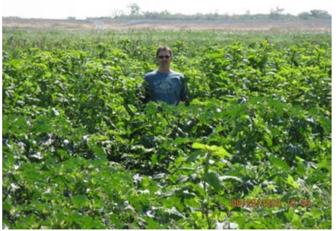
and the Johnson grass in field 101 is 4 to 5 feet

The weeds have continued to grow in both height and diameter of stalk. The pigweed in field 79 are at a height of 5 to 6 feet