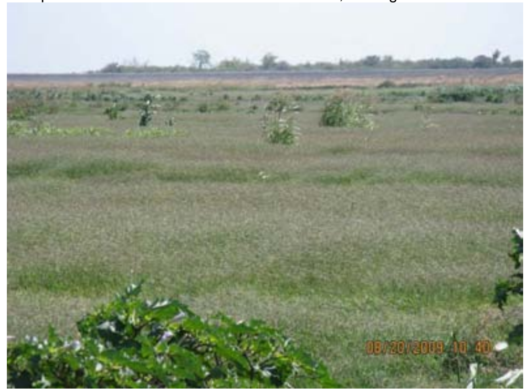
This photo is in the north part of the field, looking east.

For the next location of the roving SR, the researchers have requested a field that is heavily vegetated with Bermuda grass. Field 79 is attributed as NV, with primarily Bermuda grass in the south of the field and pigweed, Johnson grass, Bermuda grass, and jimsonweed in the north. This photo is in the southwest corner of the field, looking northeast.