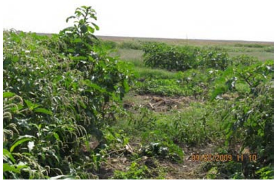
This is the station facing west, the windward side.

This is the station facing east. The cleared area is due to the researchers driving into the field from the east and crushing the vegetation.