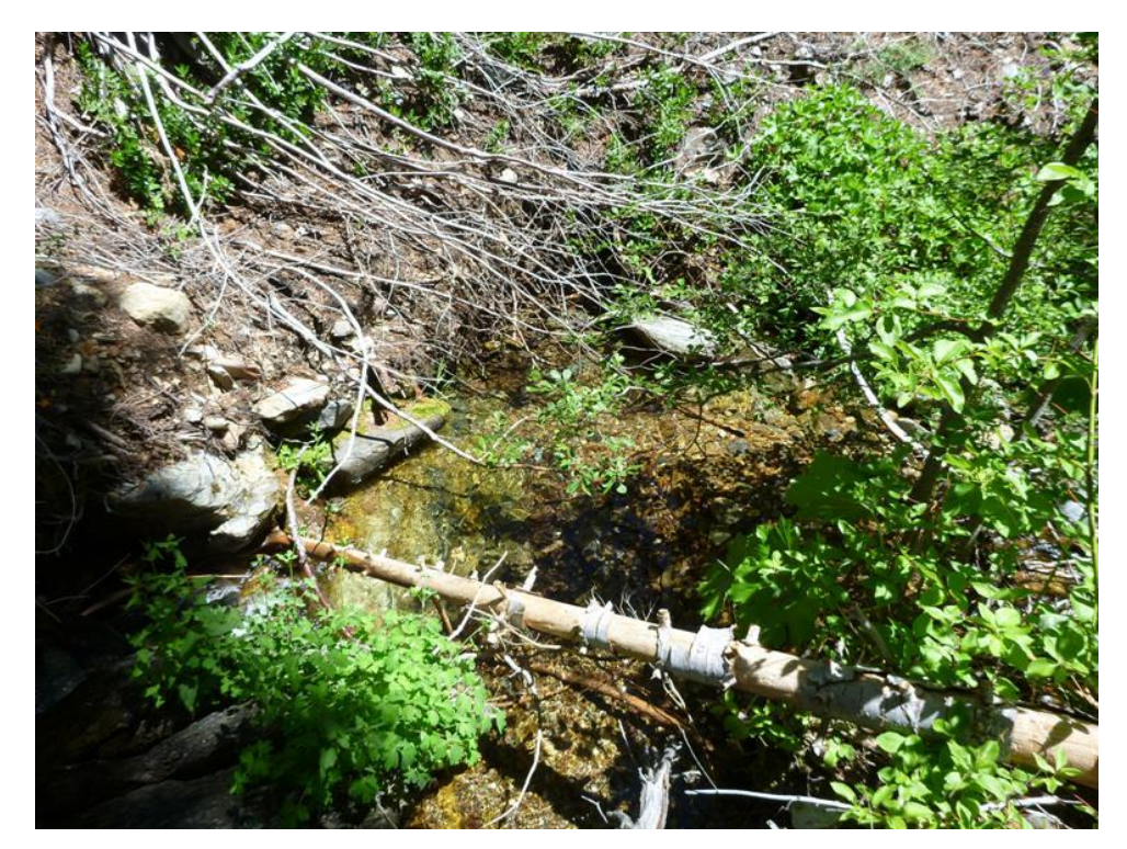
Figure 3. Cody Creek where diversion was located. (June 28. 2013)