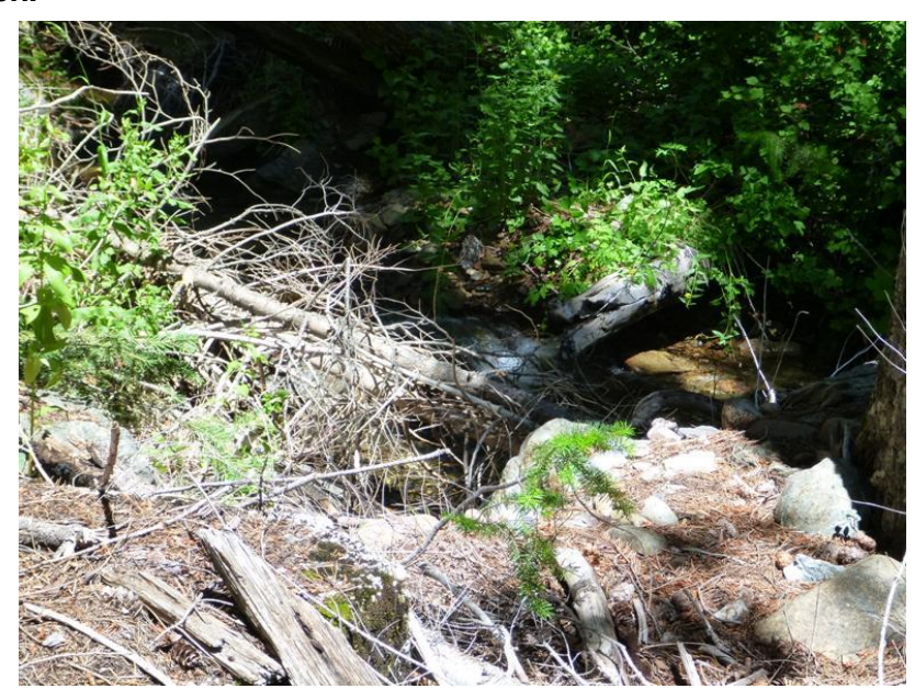
Figure 2. Cody Creek just upstream of diversion point. (June 28. 2013)