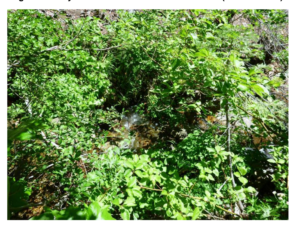
Figure 4. Cody Creek downstream of diversion point, within the instream flow dedication reach. (June 28. 2013)