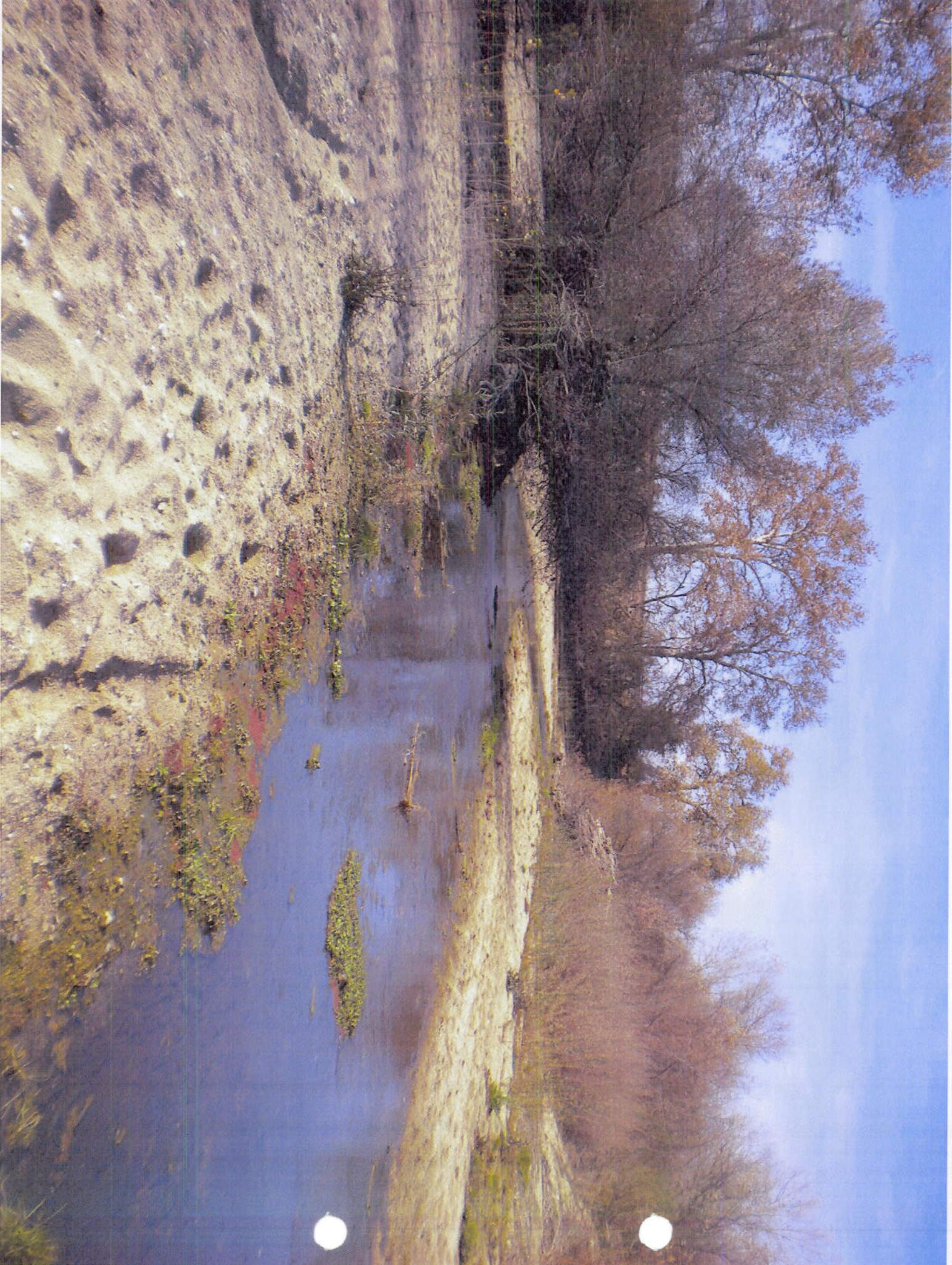
1) LOOKING DOWNSTREAM (SEE BACK OF PAGE)