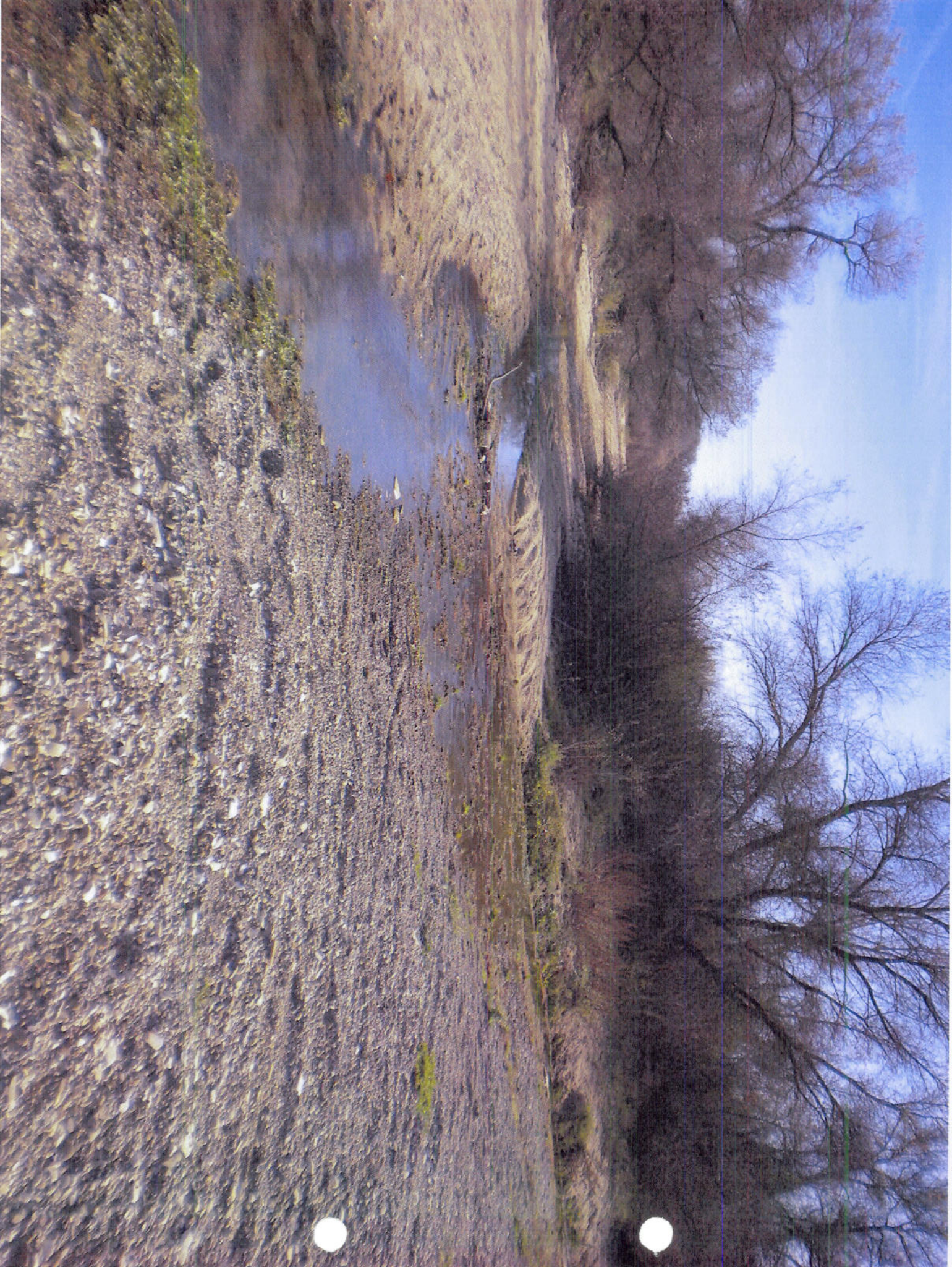
2.) LOOKING UPSTREAM (SEE BACK OF PAGE)