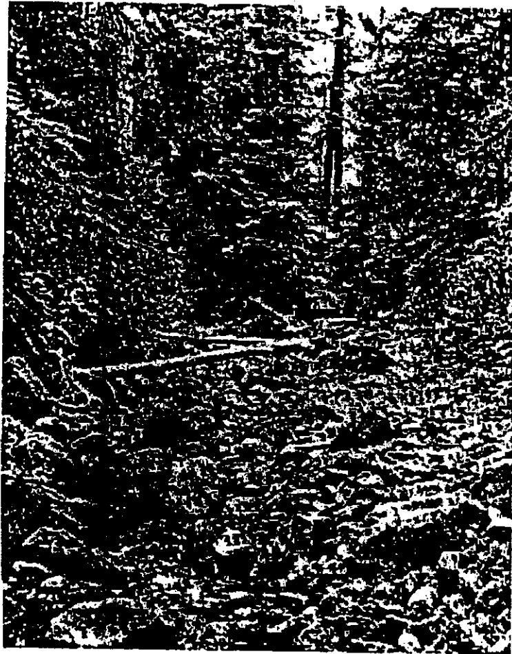
FIGURE 1-Bummer Lake Creek, Del Norte County, before logging 1967. Boulder and rubble sized materials made up the streambed.