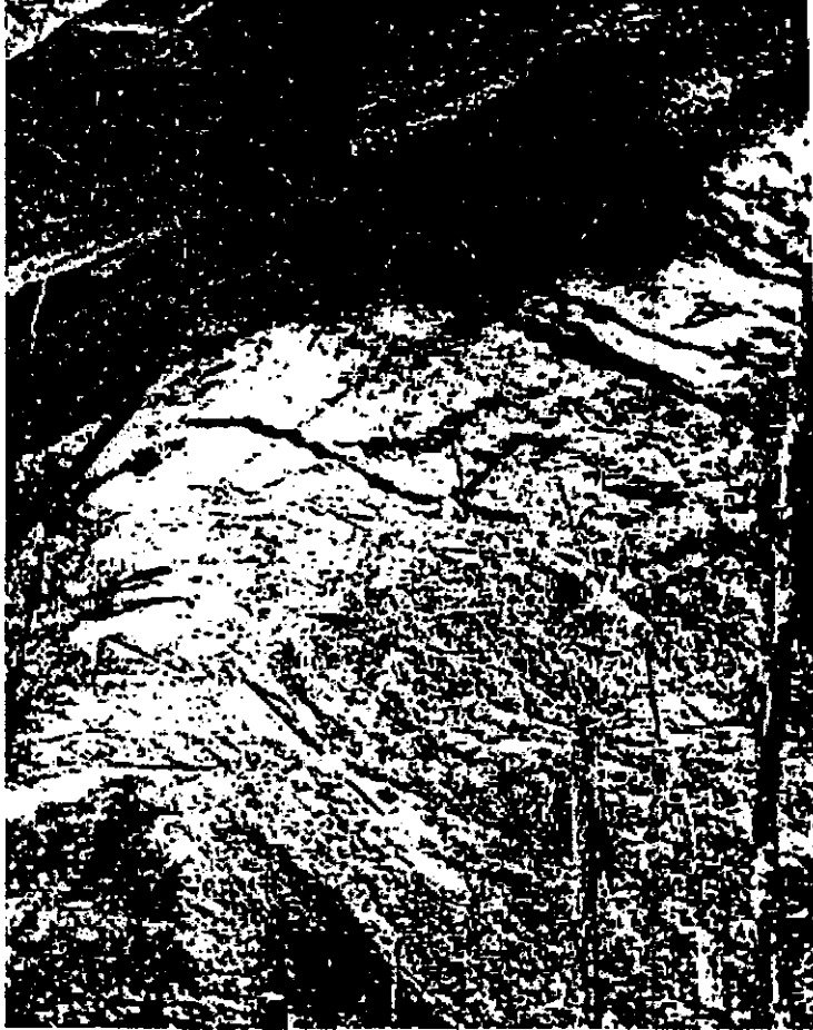
Fork Casper Creek, Mendocino County, immediately after road construction in 1967. Bulldozer operated extensively in the stream channel and materials from near 4718 slid into the stream.