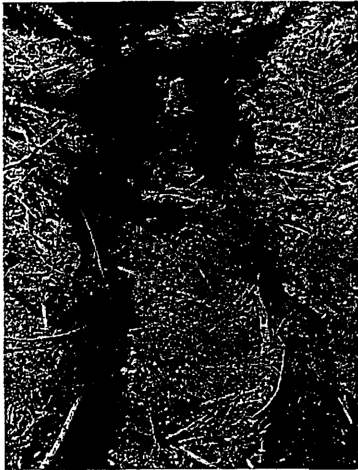
FIGURE 2-Little North Fork Noyo River, Mendocino County, immediately after logging debris removal, 1969. The stream's course was formed by bulldozer tracks.