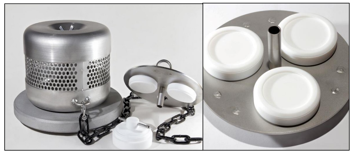
Figure 1: Example PSD components using Chemcatcher deployment kit

of water sampled, the concentration found does not directly represent the concentration of the compound per volume of water (ug/L). Rather, the concentration is measured by the average accumulated compound per time or days of deployment (ug/day).