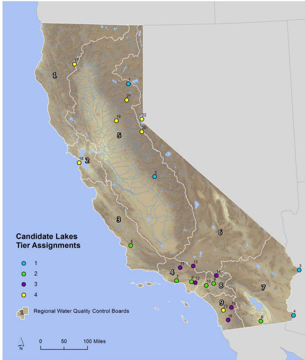
Figure 1. Map of sampling locations. Lake names are indicated in Table 5.