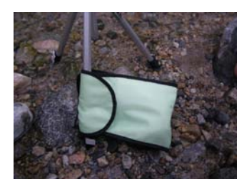
Fig. 10 Sandbag on leg