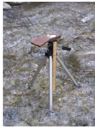
Figure 5 Tripod/Densiometer shallow water

Keep the densiometer level by raising or lowering the tripods legs or center post (Figs 5 and 6). To ensure that the densiometer is level, check the round bubble level indicator found in the densiometer's lower right-hand corner.