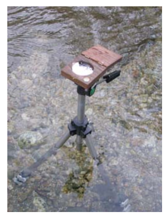
Figure 6 Tripod/Densiometer deeper water

Keep the densiometer far enough away from your body so that your head is just outside the grid (12-18" away) and 0.3 m (1 foot) above the water surface with your face just