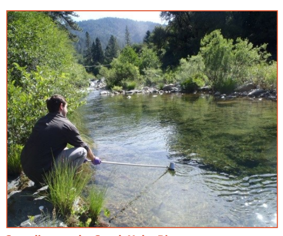
Sampling on the South Yuba River.

Since 2007, the Central Valley Water Board has monitored fecal indicator bacteria (FIB) at swimming holes and recreational rivers during the summer months. The goal of the project is to determine if there is evidence that recreational beneficial uses are not being met and, if so, identify potential sources of fecal pollution. The Central Valley Water Board has coordinated with local watershed groups to identify popular swimming areas and to conduct the sampling. Over the last seven years, SWAMP staff and their partners have monitored 172 sites and collected nearly 3,000 samples.