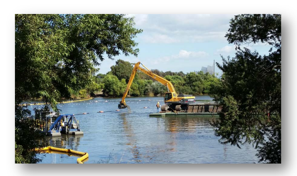
Figure 9. Machado Lake Sediment Remediation.

The Los Angeles Water Board will also shift focus to additional nonpoint sources that have been assigned load allocations in recently adopted Total Maximum Daily Loads, such as horse/intensive livestock facilities, grazing activities, and contaminated sediment (Figure 9). The Total Maximum Daily Load implementation priorities are ambitious, and the Los Angeles Water Board will leverage resources from other funding sources and programs in order to accomplish goals.