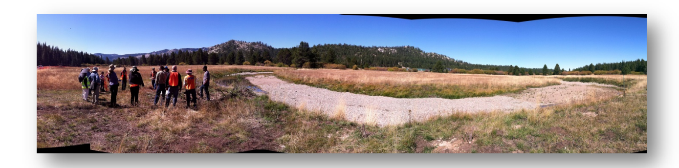
Figure 10. Upper Truckee River Restoration.

Lahontan Water Board staff members managed four Clean Water Act section 319(h) nonpoint source grants, two implementing the Lake Tahoe and Truckee River Total Maximum Daily Loads (Figure 10). These were managed on schedule and milestones met –three of the projects were completed with two in the Lake Tahoe and Truckee River Watersheds. Five new grant agreements were under development for new projects implementing the Lake Tahoe and Truckee River Total Maximum Daily Loads. Two of the grant agreements were executed and the other three will be executed by December 2014.