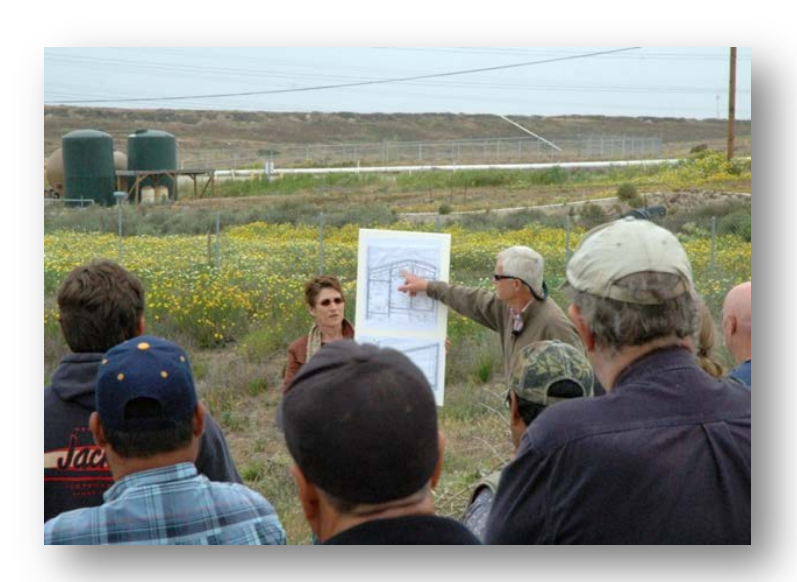
Figure 8. Ventura County Agriculture Irrigated Lands Group Education Class.