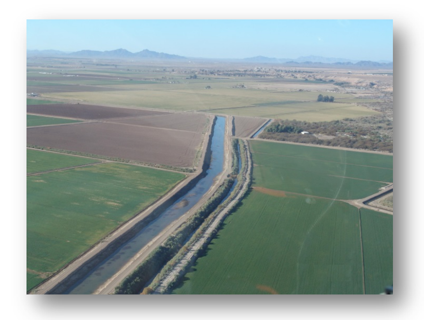
Figure 11. Agricultural areas in Colorado Basin Water Board region.

In October 2013, Palo Verde Irrigation District submitted its Coalition Group's membership farming over 6 acres in the compliance program. The enrollment of irrigated lands covered 93,000 acres and over 99 percent of the farms (Figure 11). The Palo Verde Outfall Coalition Group's water quality monitoring program began in November 2013, and they submitted their first Annual Monitoring Report dated March 7, 2014 to the Colorado River Basin Water Board. Implementation of Bard Valley Agricultural Waiver began in February 2014 with the Bard Water District forming a nonprofit coalition group to represent landowners and farmers regulated by the Conditional Waiver. The Bard Valley coalition group is developing a monitoring plan and a Quality Assurance Project Plan.