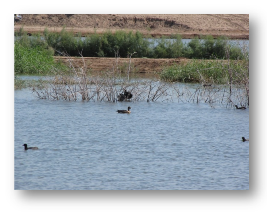
Figure 13. Desert Wildlife Unlimited planted wetland plants.

open to the public, allowing bird watching, fishing, jogging, and school educational tours. The wetland project would serve to address several water quality pollutants that continue to discharge to Alamo River like sediments and pathogens. The other two similar treatment wetlands in the same area have been reducing the sediment (total suspended solids) and pathogen (Fecal coliform) load by over 94 percent and 99 percent respectively. The Clean Water Act section 319(h) nonpoint source grant agreement was signed on April 2013. In the past fiscal year, Desert Wildlife Unlimited has planted wetland plants (cattails, bulrush and phragmites) around the separate ponds, Colorado River Basin Water Board approved the Quality Assurance Project Plan, monitoring plan, and California Environmental Quality Act and National Environmental Policy Act document (Figure 13).