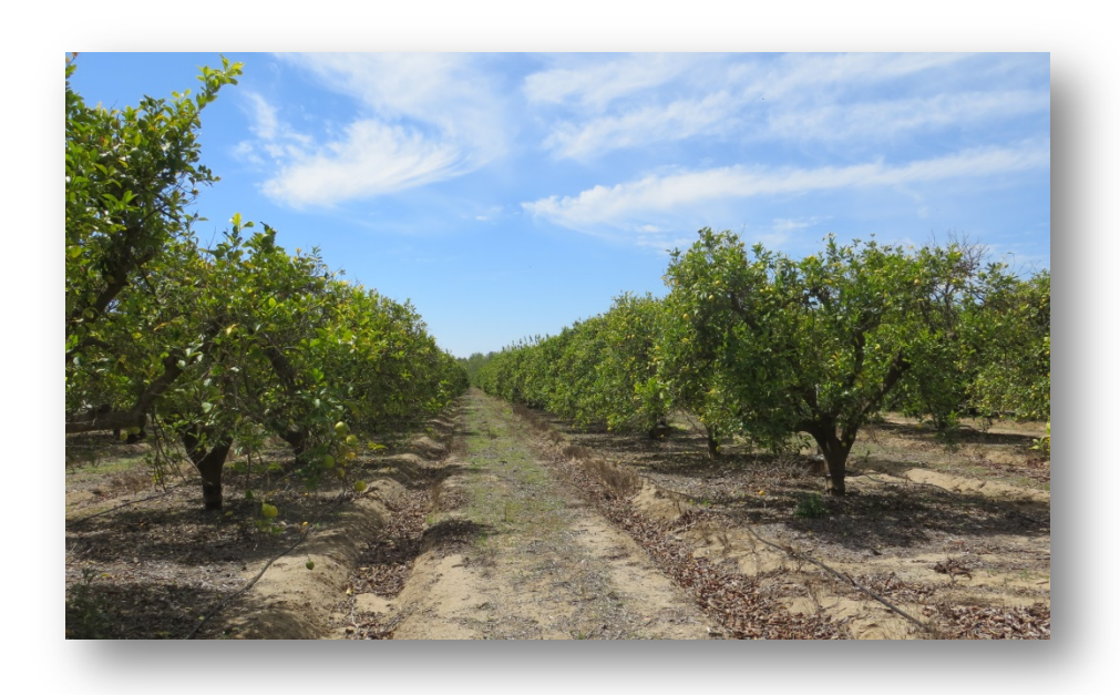
Figure 7. Farm in Ventura County.

Currently, approximately 86 percent of the irrigated acreage in the Los Angeles Water Board region is enrolled in the Irrigated Lands Waiver. Increasing the percentage of enrollees remains a priority for the Los Angeles Water Board. Enrollment increased in Ventura County this reporting period, from 1,160 members and 75,800 acres enrolled to 1,196 members and 77,019 acres enrolled, due to the Los Angeles Water Board outreach to growers who had let their membership lapse (Figure 7). Enrollment increased in Los Angeles County as well, from 140 members to 202 members, due to Los Angeles Water Board staff members working for months with Southern California Edison to enroll growers who lease Southern California Edison land. Los Angeles Water Board staff members are also coordinating with the Los Angeles Department of Water and Power on a similar effort to enroll growers who lease Department of Water and Power land.