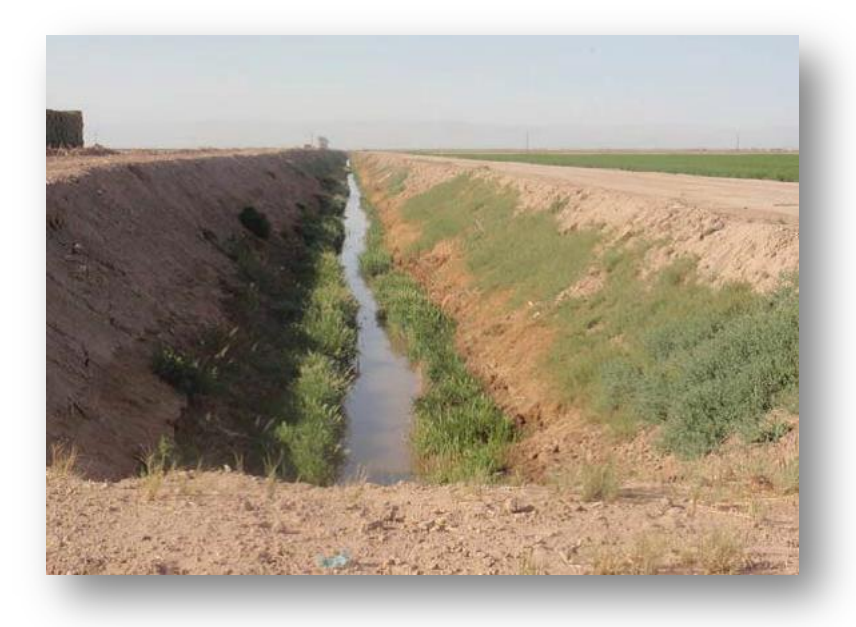
Figure 12. Imperial Irrigation District drain maintenance.

Imperial Irrigation District Precision Drain Cleaning Best Management Practice Plan. Activities commenced in June 2010 on a $900,000 Proposition 50/84 grant funded project titled Precision Drain Cleaning Best Management Practice Plan and it ended in March 2014. The purpose of the project was to reduce the impacts of Imperial Irrigation District's dredging and maintenance operations throughout the drainage system by implementing a drain improvement program. The project funded a Geographic Positioning System guided drain cleaning program and implementation of a program to utilize vegetation as drain erosion inhibitor. In the past fiscal year, Imperial Irrigation District has employed Geographic Positioning System guided drain cleaning as an integral component of a system-wide drain maintenance program, implemented a program to utilize vegetation (i.e., salt grass) as a drain erosion inhibitor and use of herbicides that protect beneficial plant species, and implemented the Drain Water Quality Improvement Plan which monitored water quality monthly in seven major drains and quarterly in eighteen minor drains (Figure 12).