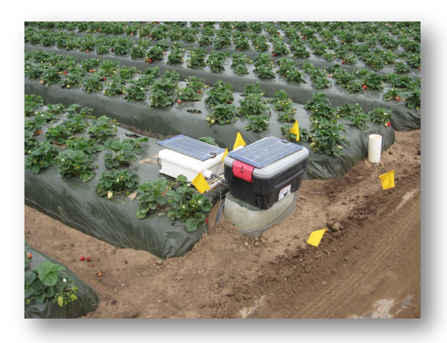
Figure 6. Strawberry fields in Central Coast.

In 2013 University of California Cooperative Extension completed a grant project to improve irrigation and nutrient management in strawberries. Strawberries are a high value crop currently grown on about 40,000 acres in the Central Coast. The project determined current water use and nitrogen management practices in commercial strawberry fields, estimated nitrate leaching losses and developed nitrogen uptake guidelines and a water use model. The study concluded that strawberry nitrogen uptake is relatively slow, much slower than vegetable crops. Given this low nitrogen uptake rate, strawberries can grow with relatively low soil nitrate reserves, and with careful irrigation, nitrate leaching losses from strawberry fields can be minimized (Figure 6). Better matching fertilizer release rates with crop uptake patterns can potentially reduce nitrate leaching losses during establishment and during winter months.