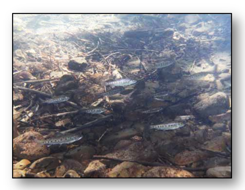
Figure 4. Steelhead and Coho Salmon in the Garcia River

Water Board and the Nature Conservancy. Approximately 65 permanent monitoring reaches were revisited to assess whether or not conditions in the watershed have been improving since the monitoring program's inception in 2007. Approximately 60 stream crossing upgrades and 9 crossing have been decommissioned from the stream network. In addition, approximately 11 miles of road are being hydrologically disconnected from the stream network.