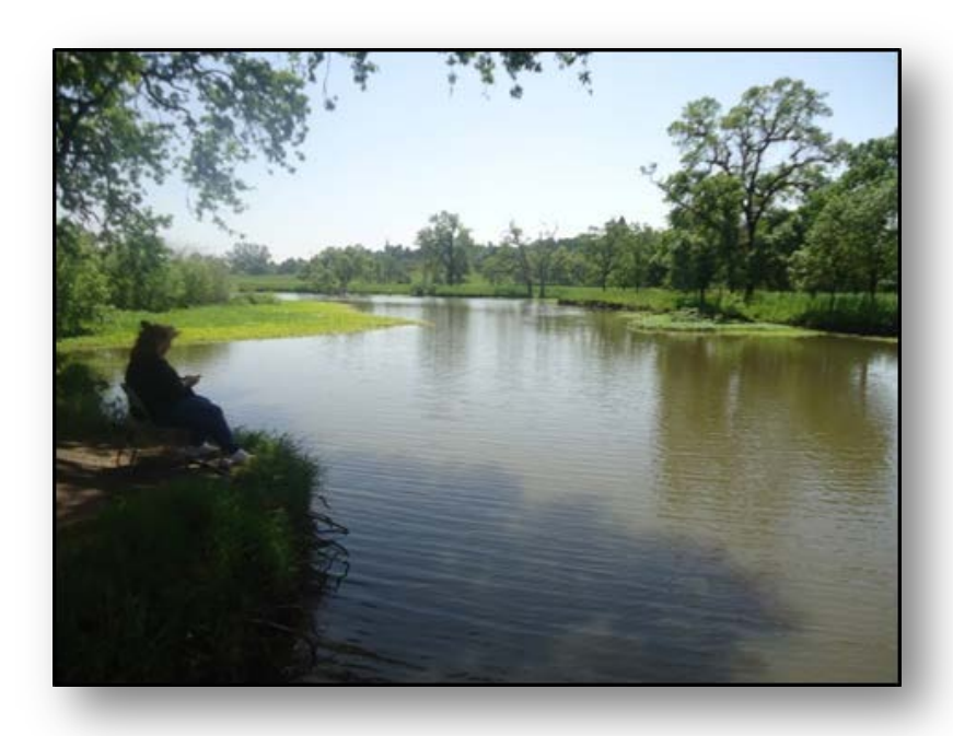
Figure 3. Laguna de Santa Rosa Upstream of Occidental Road.

by the United States Environmental Protection Agency, the State Water Board, and the San Francisco Estuary Institute to conduct a basin-wide wetland resource assessment and historic ecology survey, which may be used as a means by which to prioritize and monitor future wetland and riparian restoration efforts. The water quality and administrative benefits to be gained through these early implementation efforts are substantial and worthwhile.