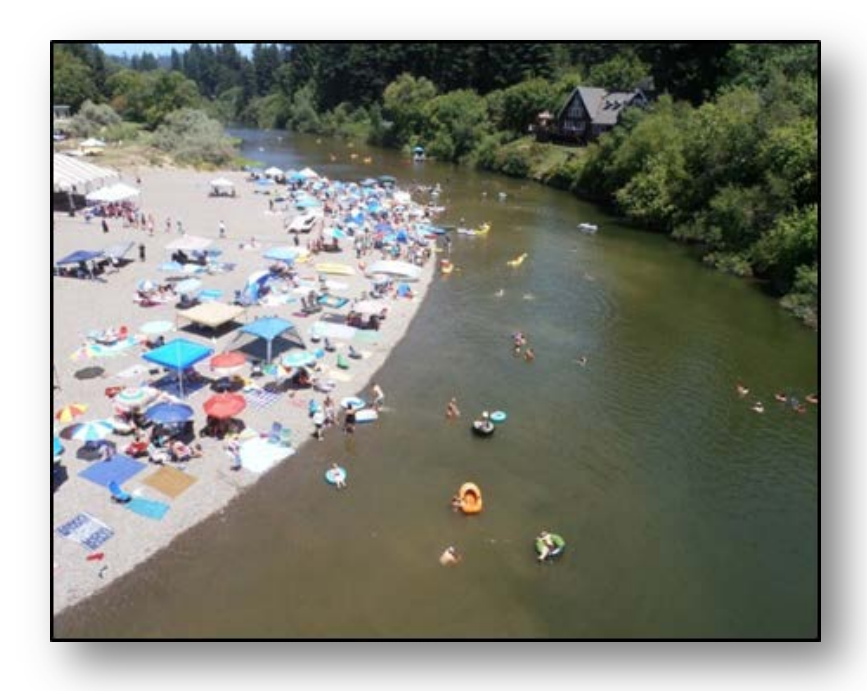
Figure 2. Russian River at Monte Rio Beach

Coordination with local county agencies to consider solutions to pathogen challenges is ongoing.