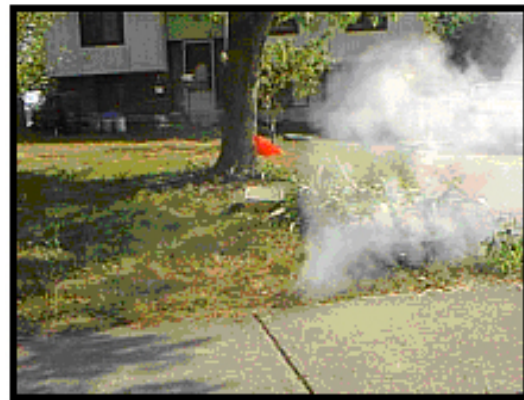
Figure 4.2. Smoke rising from a faulty lateral line.

High Enterococcus (ENT) counts resulted in repeated advisories at a recreational site on the Chesapeake Bay. Intensive sampling identified a “hot spot” in the water adjacent to a storm drain at one end of the beach. Most samples collected from both the hot spot and storm drain were positive for a human-associated fecal marker (BacHum). Long-term storm drain sampling at spring low tides, the only time the outfall was available for sampling, revealed high concentrations of Enterococcus (450 CFU/100 mL to >3,000 CFU/100 mL). The advisories were most frequent if sampling occurred on the outgoing tide; and investigators suspected a large home subdivided into rental apartments in line with the storm drain as the source. Denial of access by the property owner precluded a dye test, so a smoke generator and fan were used to blow smoke into the storm drain during a low spring tide. The emission of smoke from plumbing fixtures in the building demonstrated a direct connection. Repairing the sewer line from the house and connecting it to the sanitary sewer quickly reduced the ENT counts below detection limits in subsequent samplings. No beach advisories have occurred at that location since the repair was made.