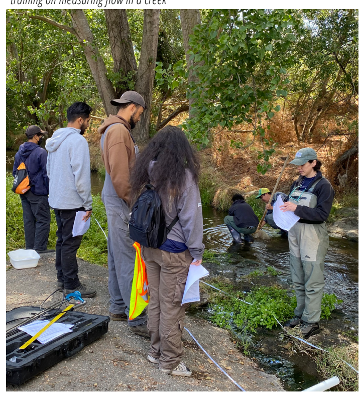
Photo to below: Water Boards staff meet with Urban Tilth, a community environmental group, for training on measuring flow in a creek