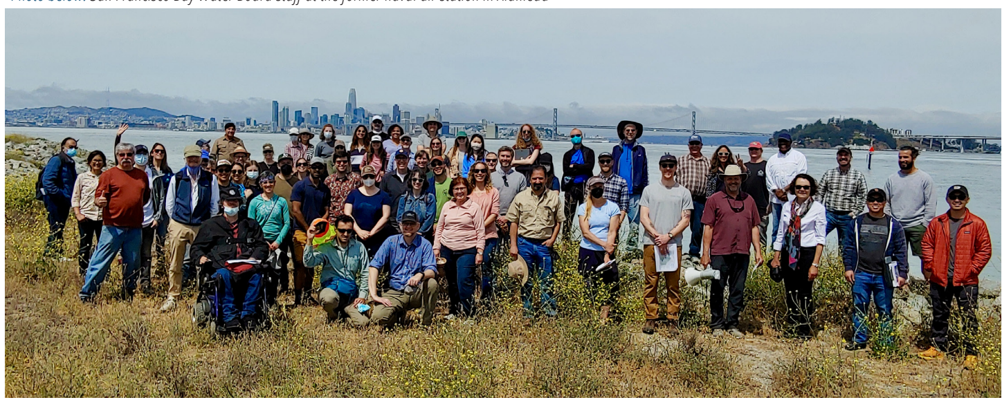
Photo below: San Francisco Bay Water Board staff at the former naval air station in Alameda

Racial equity and environmental justice actions are a key component of our March 2023 Strategic Workplan (Workplan). The Workplan communicates our priorities and, below, we outline the racial equity and environmental justice actions we have taken and are implementing, along with relevant targets and milestones. Our actions are informed by and aligned with State Water Resources Control Board (State Water Board) efforts including Resolution No. 2021-0050, condemning racism, xenophobia, bigotry, and racial injustice, and strengthening our commitment to racial equity, diversity, inclusion, access, and anti-racism.