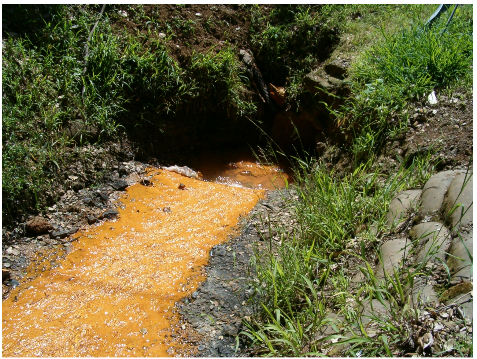
Figure 3. Leona Creek, discoloration from acidophilic bacteria