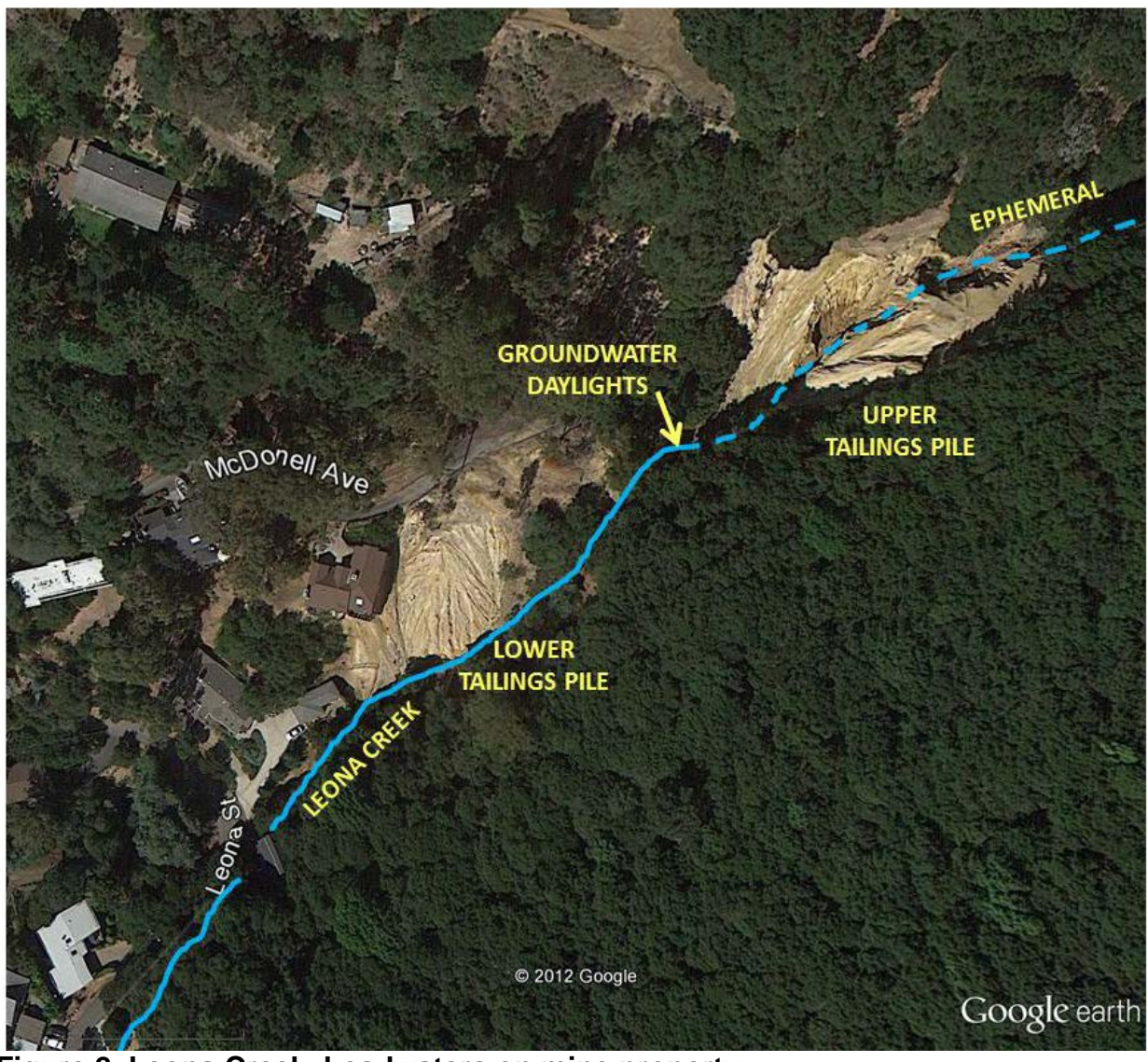
Figure 2. Leona Creek, headwaters on mine property