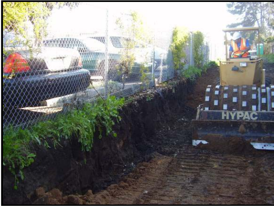
Excavation along Spur