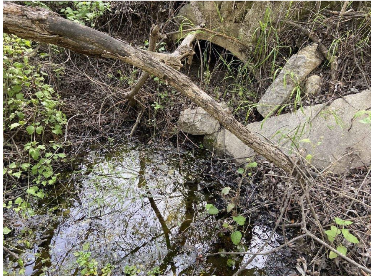
Outlet of pipe downstream from Pond 22/Permanente Creek