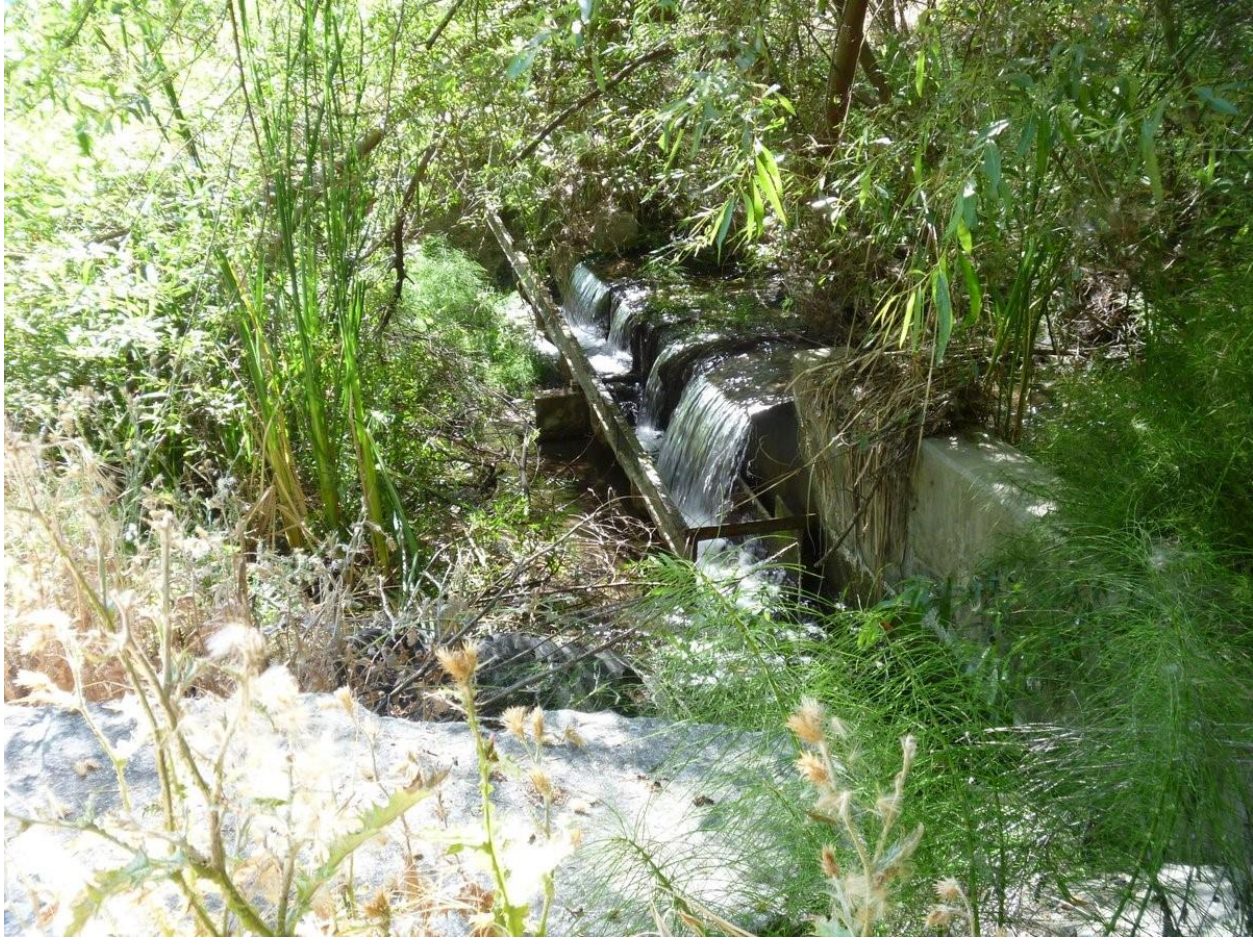
Pond 22 in-stream concrete retention dam