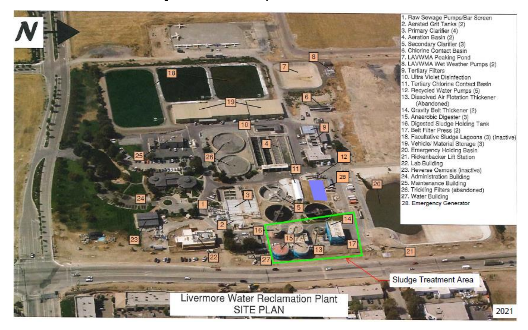
Figure B-3. Overview Map of Treatment Plant Site