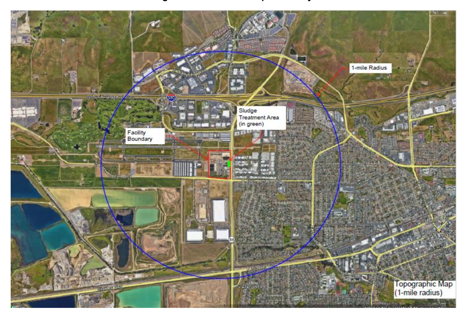
Figure B-2. Overview Map of Facility