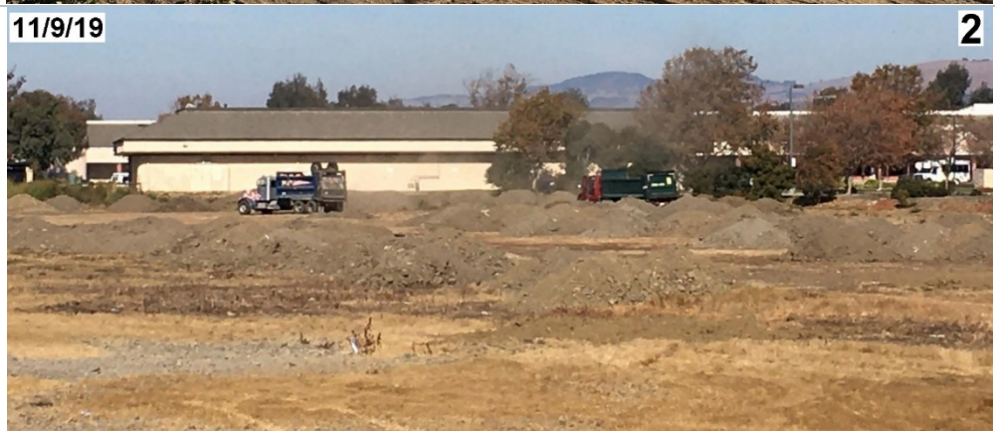
Figure 1: Photographs of Unauthorized Filling and Grading Dhillon Property on October 31, 2019, aerial image [source: CA Basin Plan Beneficial Use Viewer – Environmental Systems Research Institute (ESRI) basemap, last accessed March 8, 2021] showing total estimated area (4.4 acres) disturbed by fill and grading activities (Photos 1 and 2). Numbers and arrows show location and direction of photographs by number. Photograph 1 and 2 are from local residents, provided to the Regional Water Board by the San Francisco Bay Conservation and Development Commission (BCDC). Photograph 3 is from the Vallejo Flood and Wastewater District showing blocked storm drain. Regional Water Board staff cropped photographs and added dates and numbers.