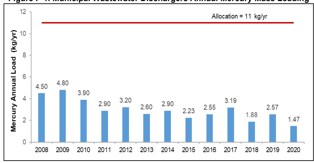
Figure F-1. Municipal Wastewater Dischargers Annual Mercury Mass Loading