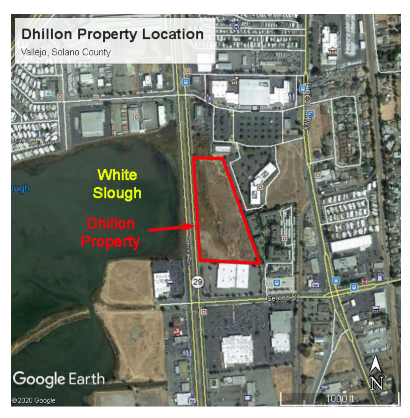
Dhillon Property Site Location

Google Earth imagery, aerial dated 9/1/2018, downloaded on 8/6/2020