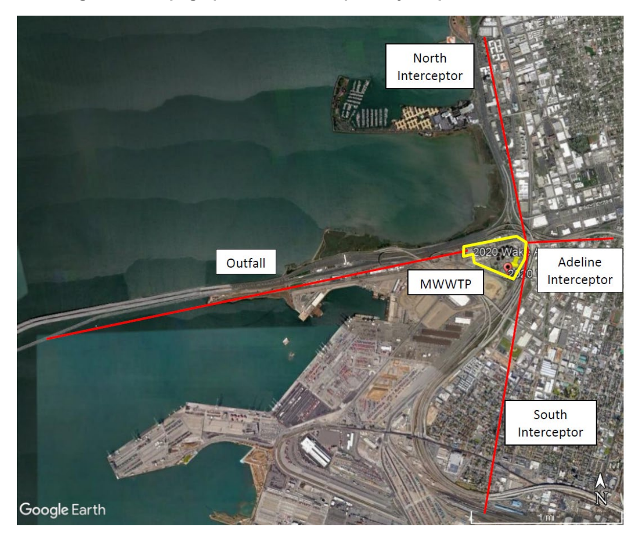
Figure B-1. Topographic / Satellite Map of Major Pipes and Structures