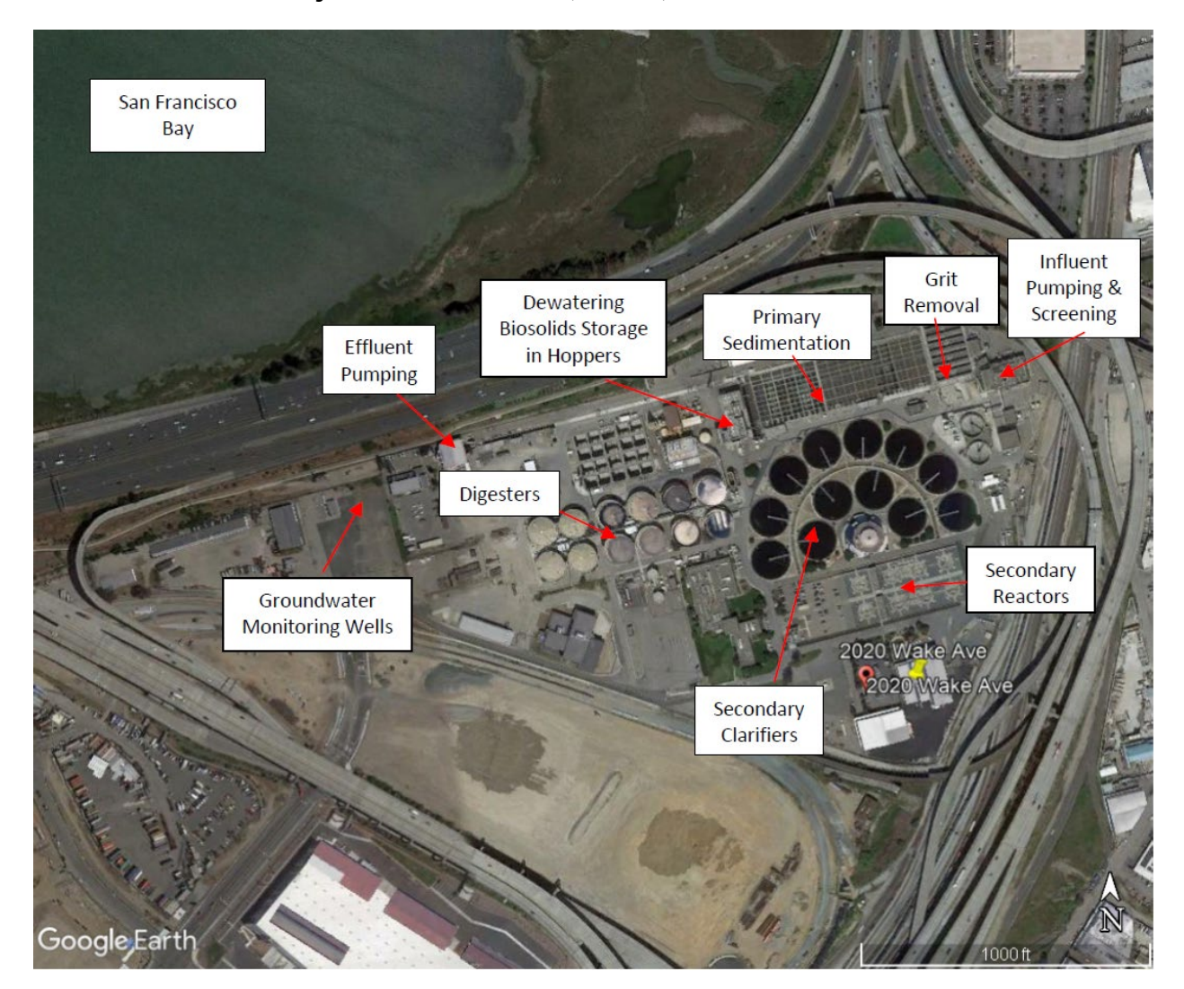
Figure B-2. Topographic / Satellite Map of Major Unit Processes, Wells, and Surface Waters