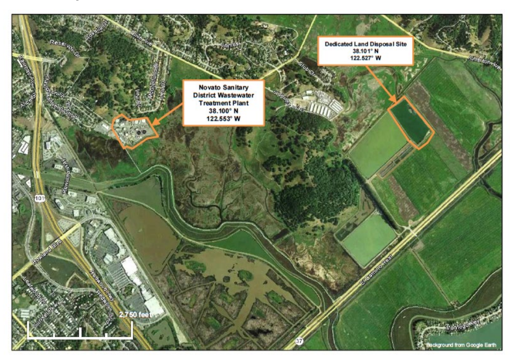
Figure B-2. Aerial Map