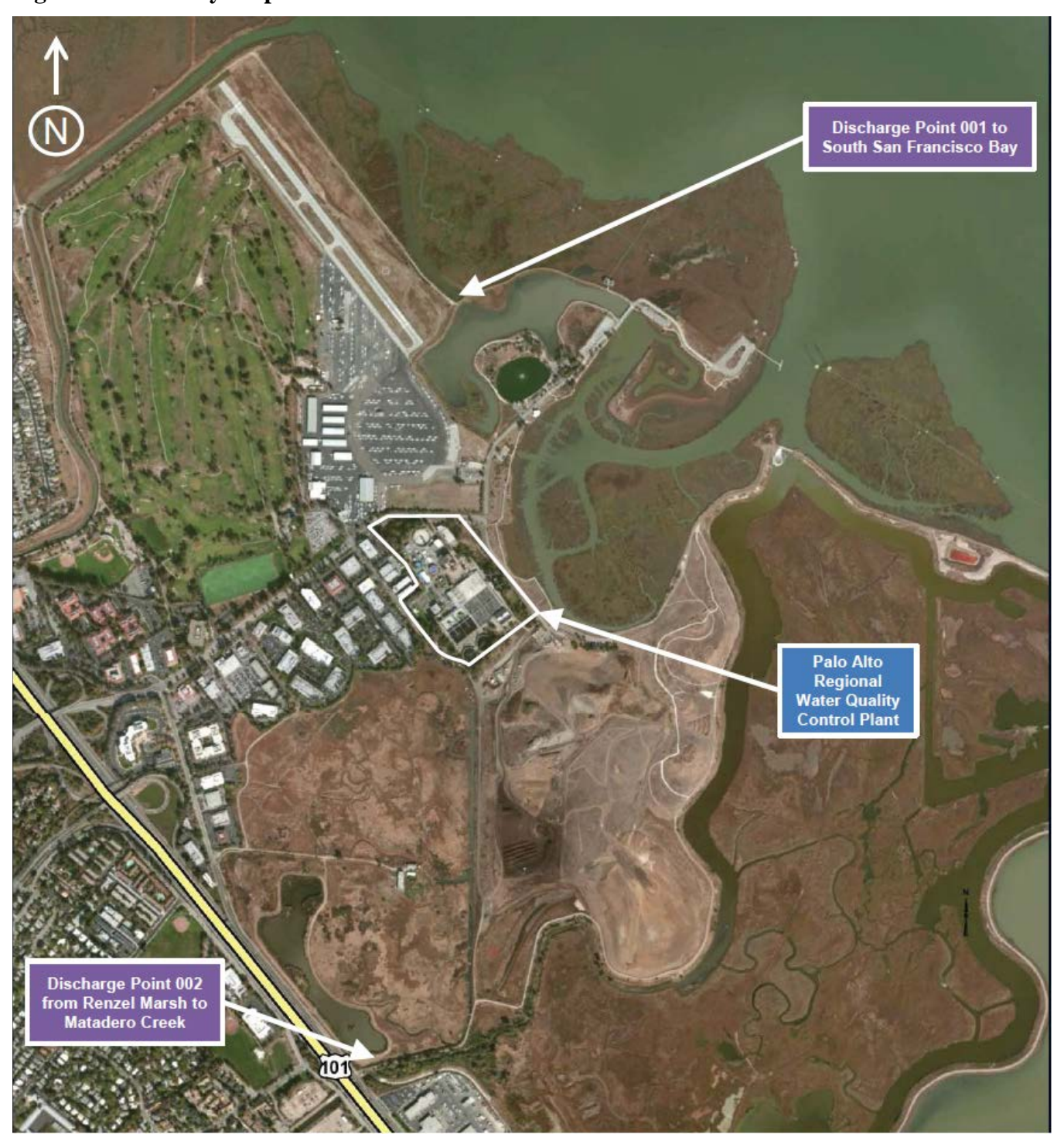
Figure B-1. Vicinity Map