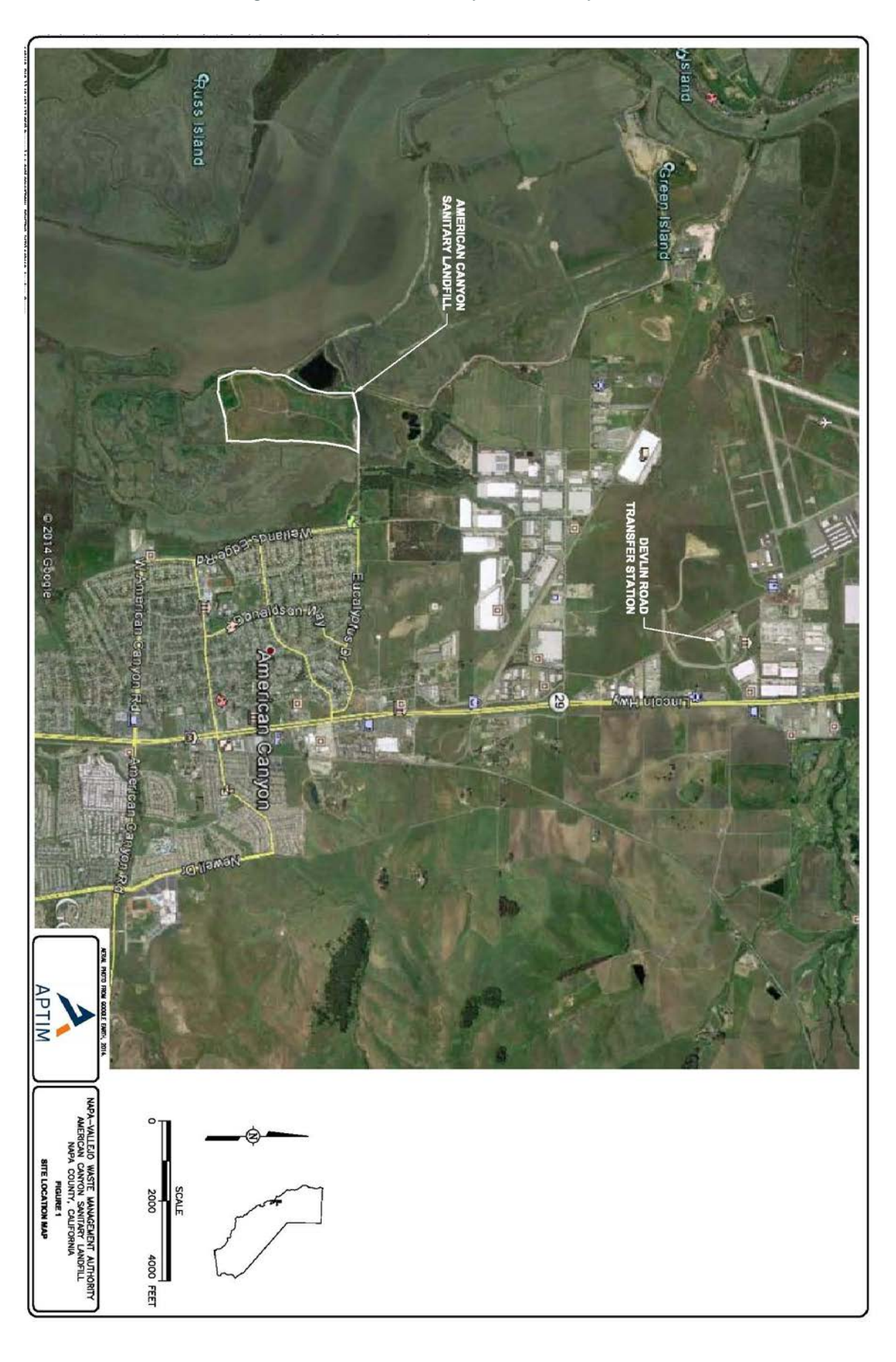
Figure 1. American Canyon Sanitary Landfill Site Location.