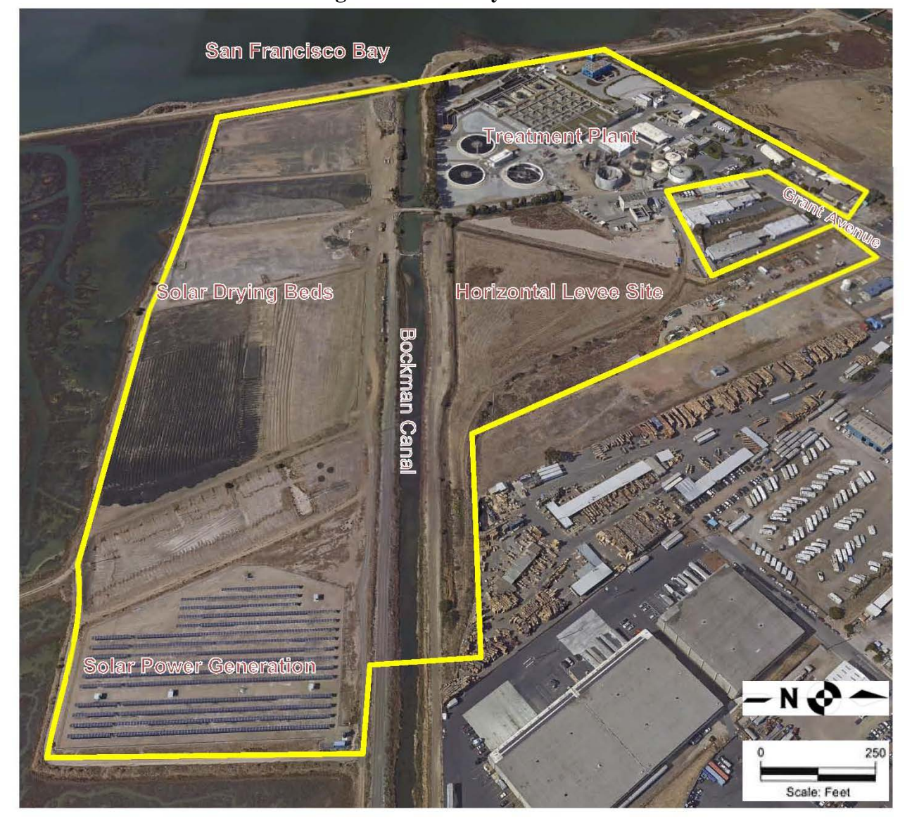
Figure B-2. Facility Overview