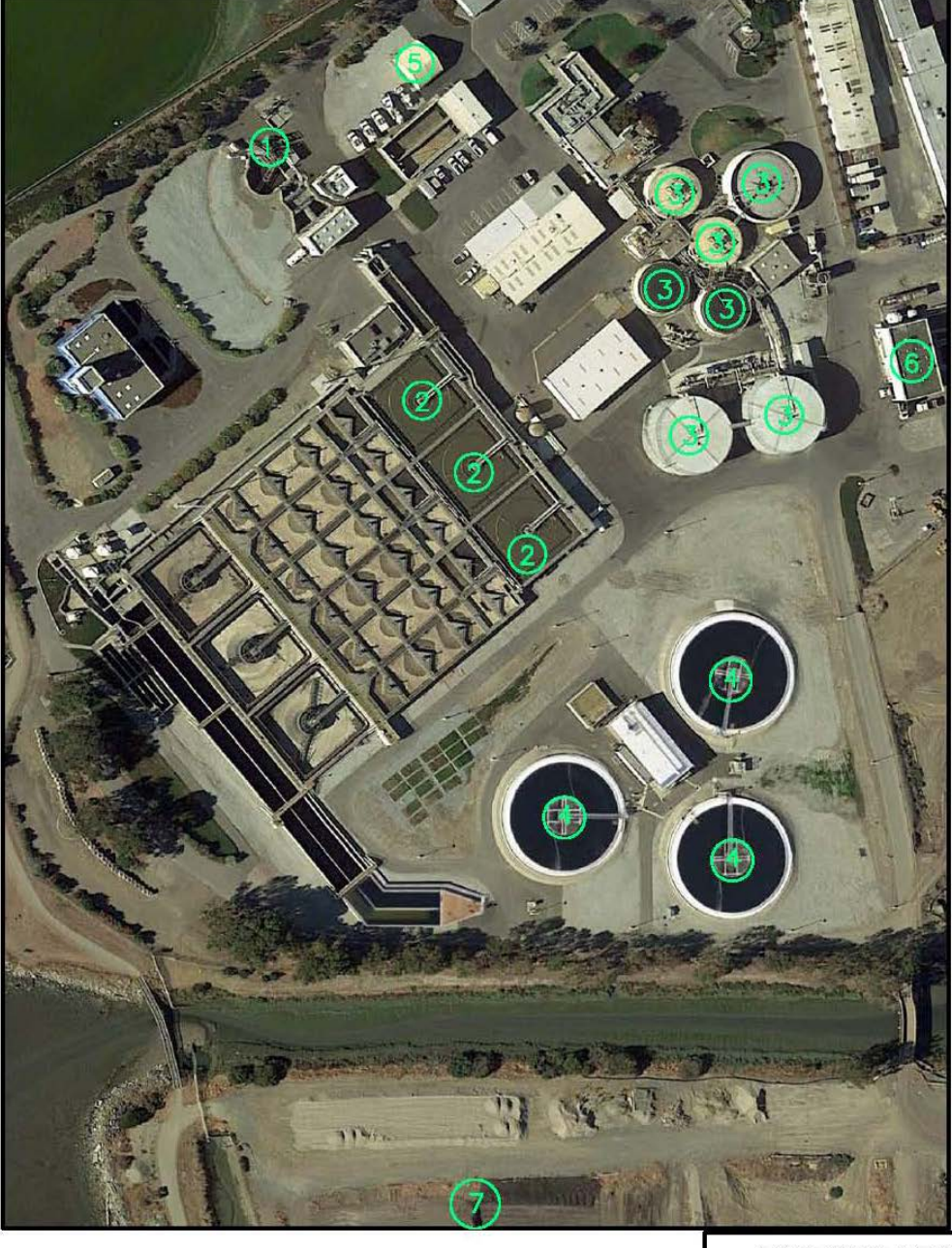
Figure C-3. Facility Legend