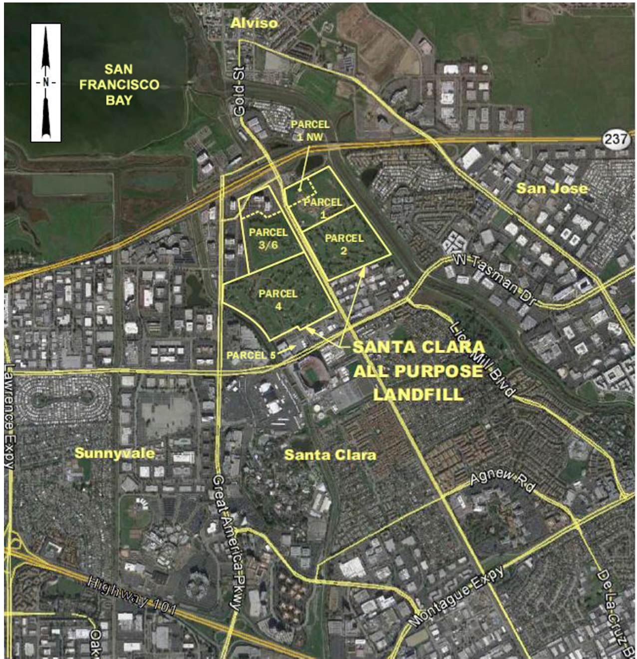
Figure 1, Landfill Location

Base map from Google Earth; Photography date: January 31, 2016.