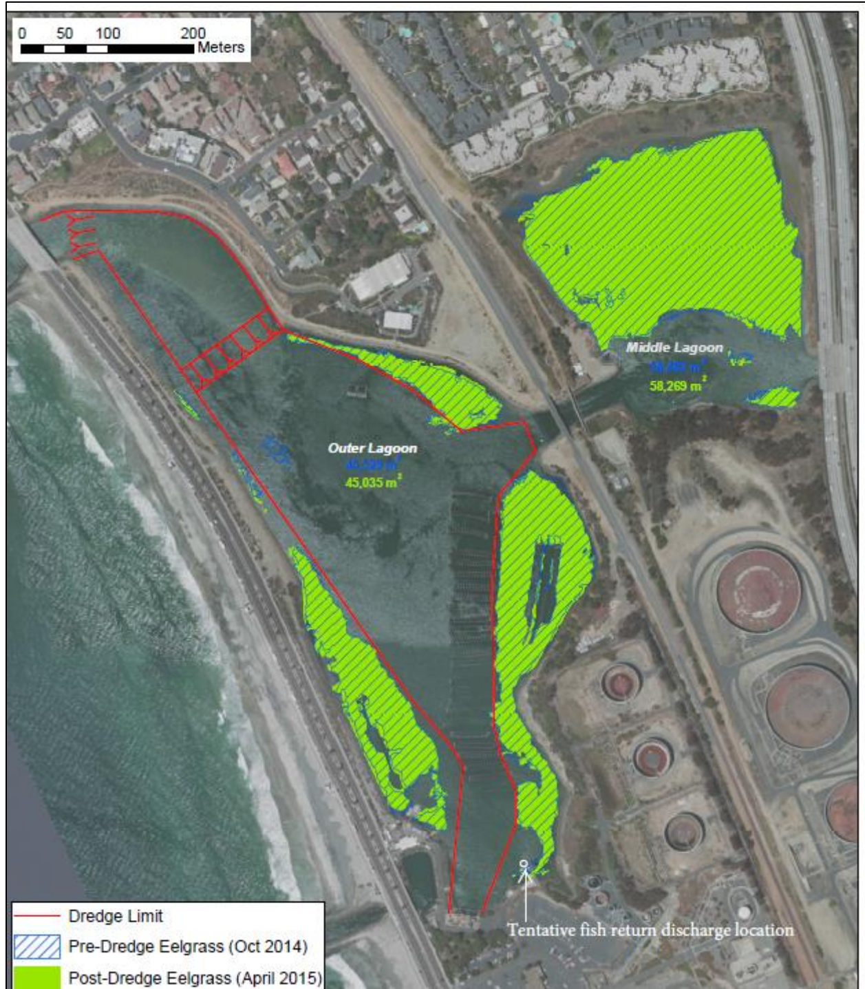
Figure 3. 2015 post-dredge eelgrass survey, showing tentative location of the Lagoon-based fish/debris return (modified from Merkel and Associates, Inc. 2015).