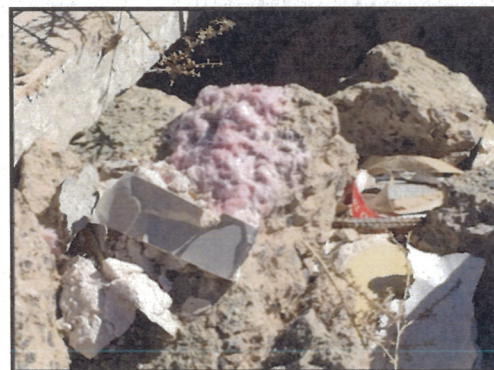
Photograph 5: Waste observed onsite.