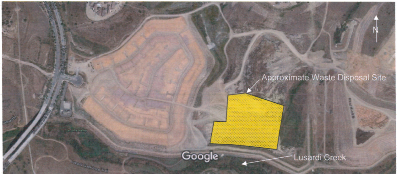
Figure 1: Aerial photograph of the CalAtlantic Homes property, and approximate disposal site area location.