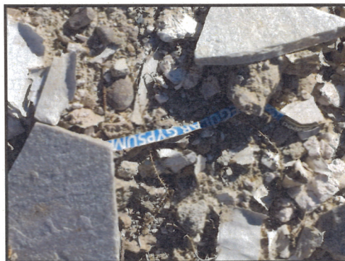
Photograph 2: Waste observed onsite.