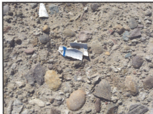
Photograph 3: Waste observed onsite.