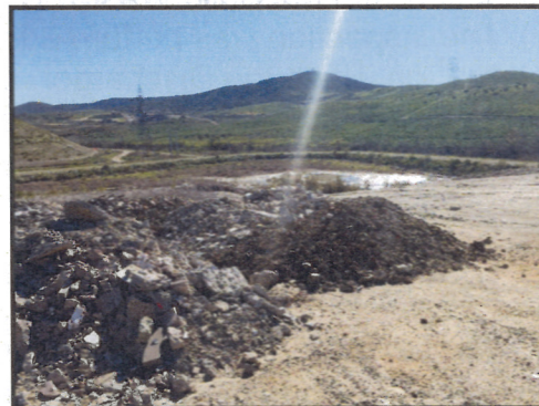
Photograph 4: Waste observed onsite.