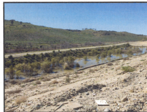
Photograph 6: Edge of disposal area.