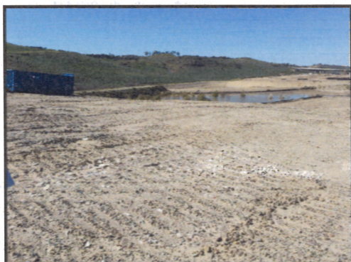
Photograph 1: Top deck of lower disposal area.

During the February 11 inspection, San Diego Water Board staff observed that the Discharger initiated a discharge of wastes, including stockpiling and burial of wastes discharged to land as shown in photographs 1 through 6.