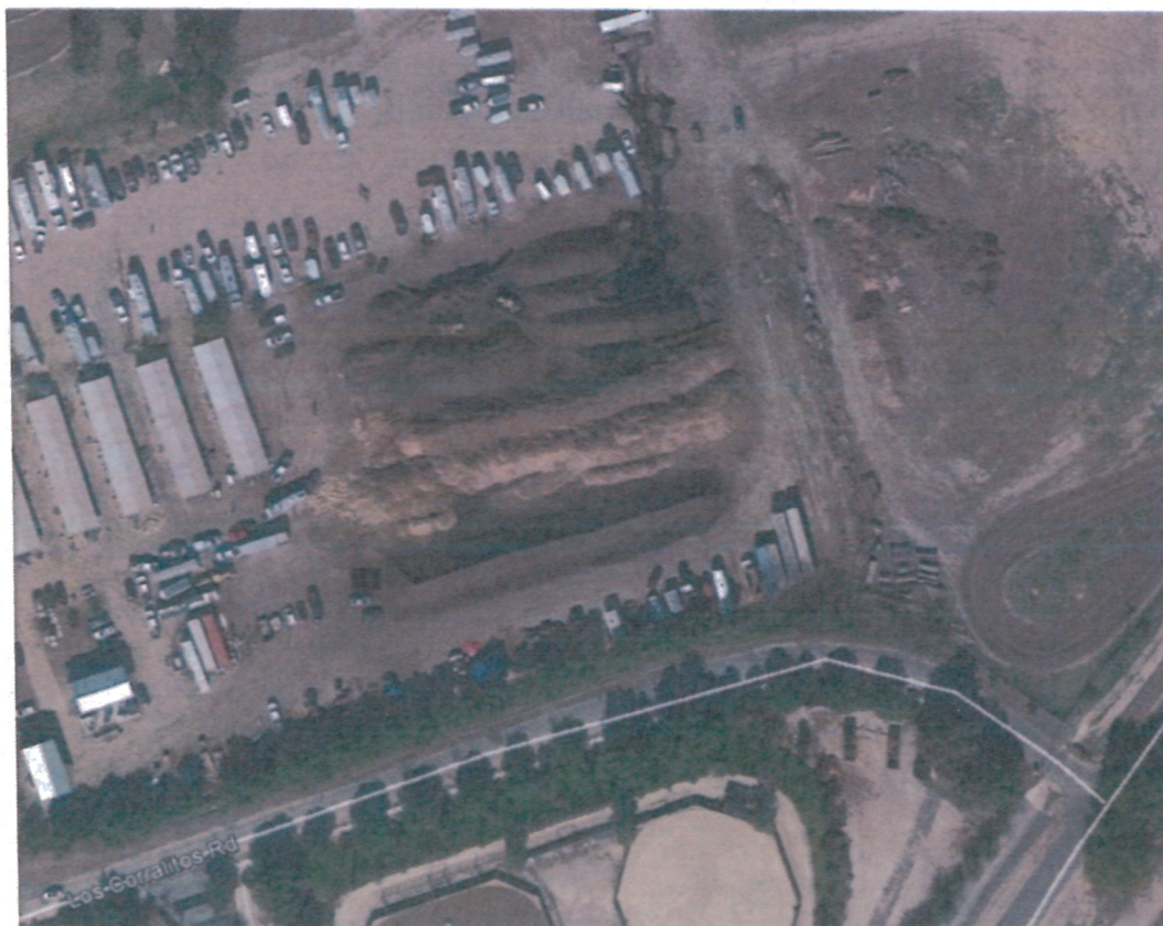
Figure 1: Aerial photograph of the composting operation on the Galway Downs Property.