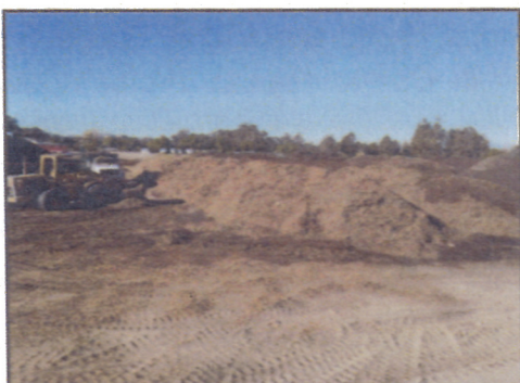
Photograph 1: Active compost windrows

During the December 17 inspection, San Diego Water Board staff observed that the Discharger initiated a discharge of compostable wastes to land as shown in photographs 1 through 4.