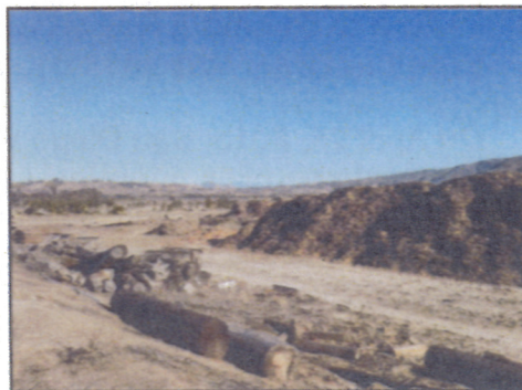
Photograph 4: Waste pile.