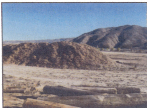
Photograph 3: Waste pile.