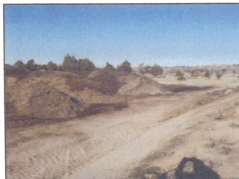
Photograph 2: Active compost windrows