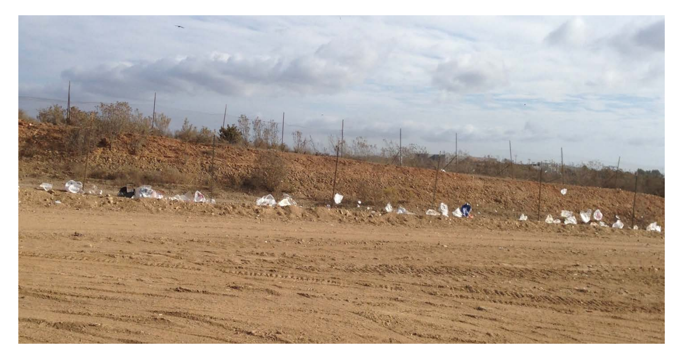
Figure 5: Photo of accumulated plastic bags on fence south of the active cell.