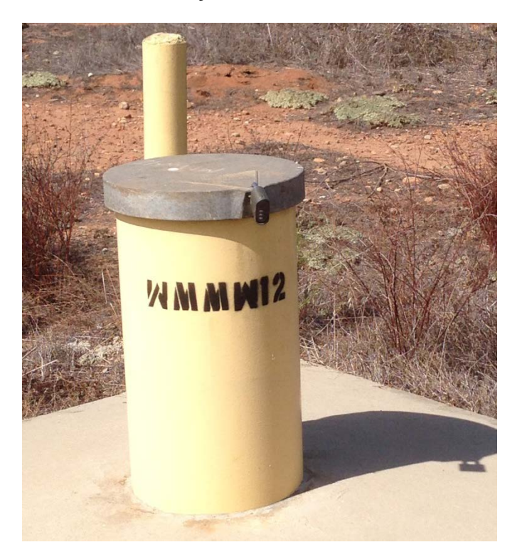
Figure 1: Photo of ground water monitoring well (WMMW-12).

Pictures taken by Ms. Leah Canada and Mr. Alex Cali on October 16, 2014