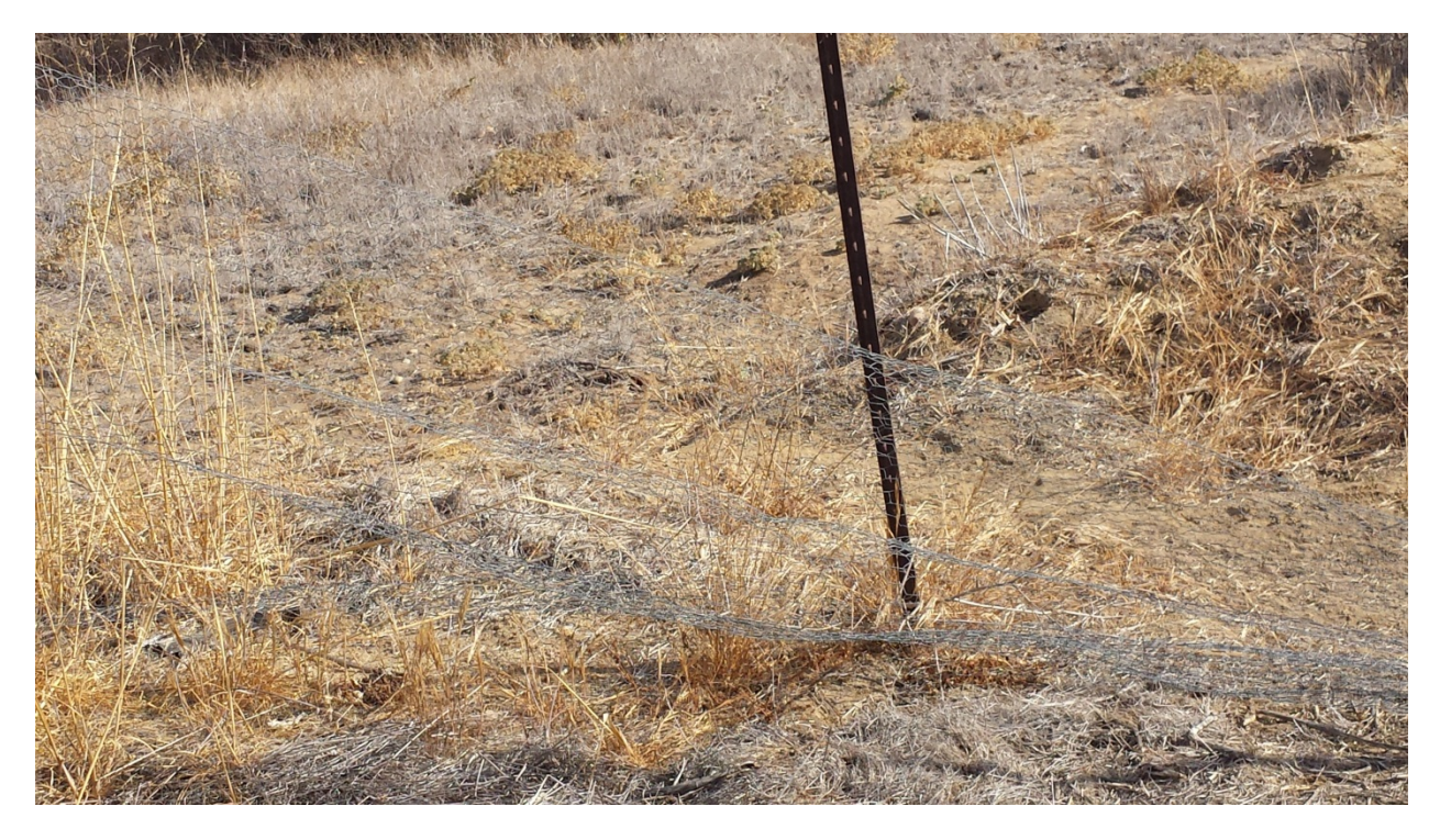
Figure 4: Photo of downed fence south of detention basin.