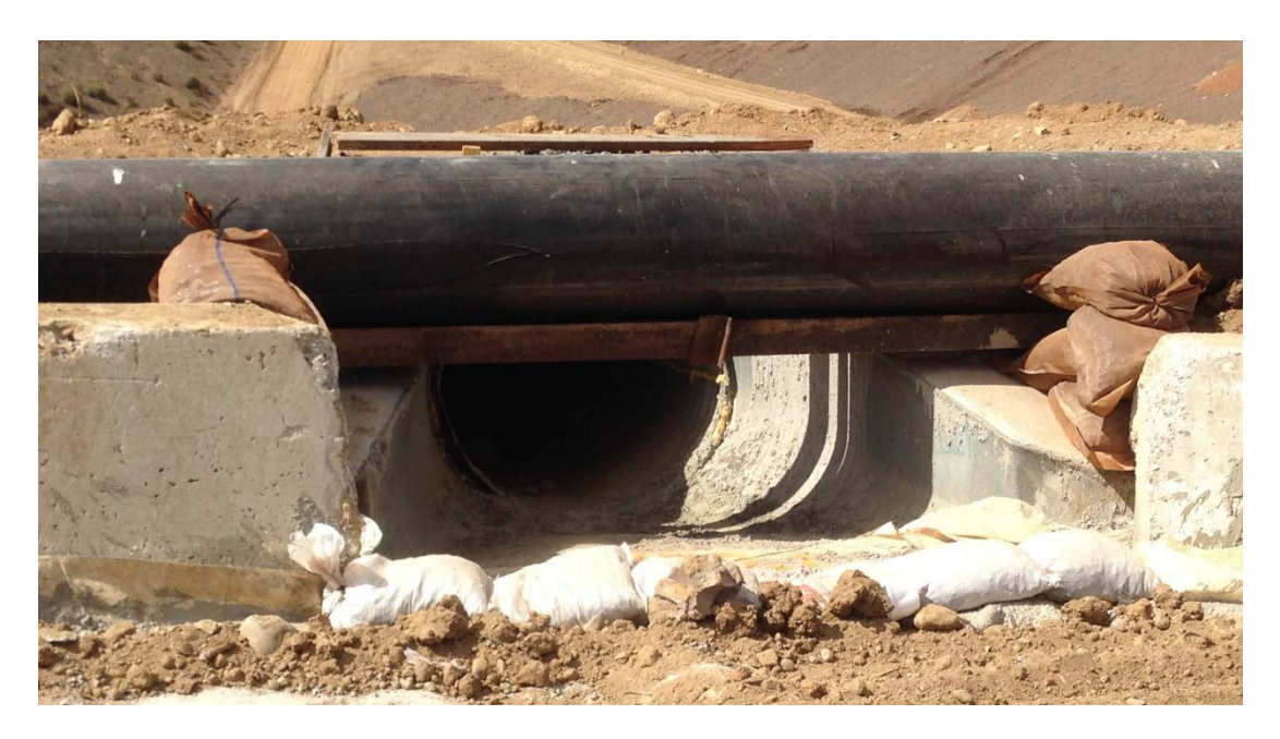
Figure 2: Photo of drain near active cell.