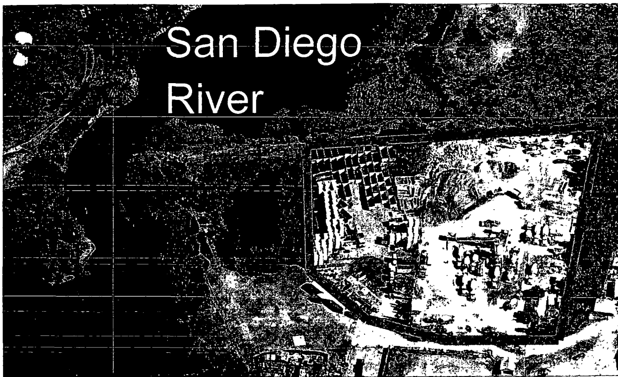
Figure 2. Site Aerial. Location of GM Materials Ready Mix site (area indicated within red line).