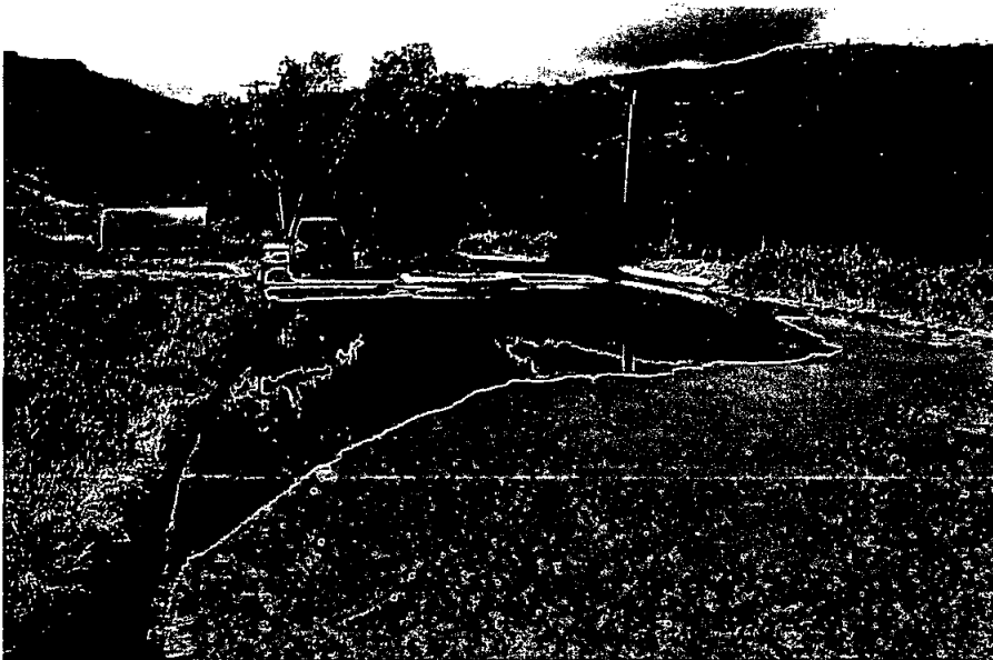
Photo 1: Ponding on access road just inside gate. Standing water was also observed in two other areas on the access road.

Site Name: Bonsall Landfill Case Number: 210029 Activity: Landfill Inspection Observed by: Cheryl Prowell and Barry Pulver Date: April 13, 2010