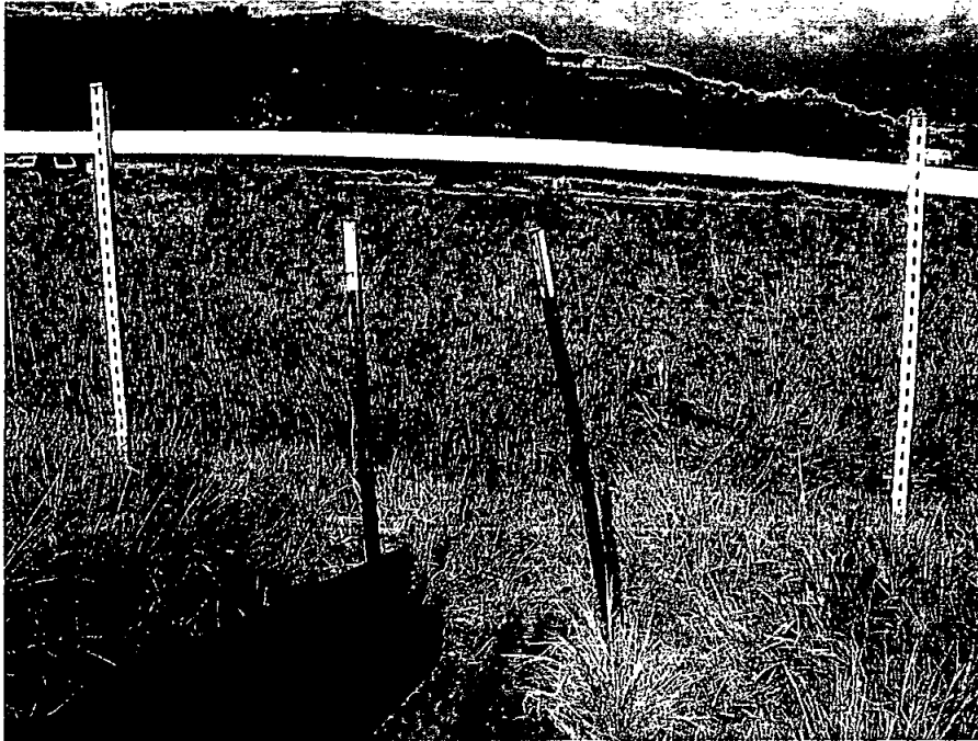
Photo 3: View of same flumes facing east. Flume is bent near outlet limiting the capacity of the flume. Vegetation is overgrown, obstructing any drainage control features, in the 20-foot area between flumes allowing water to infiltrate into the landfill.

Site Name: Bonsall Landfill Case Number: 210029 Activity: Landfill Inspection Observed by: Cheryl Prowell and Barry Pulver Date: April 13, 2010