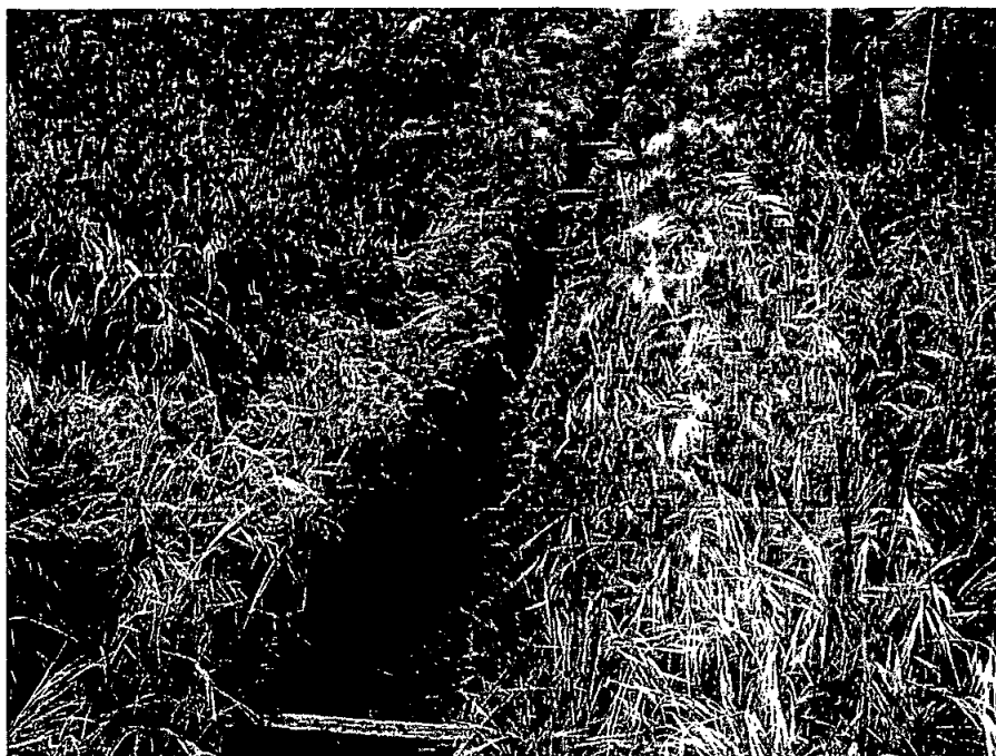
Photo 5: Flume paralleling access road. Note standing water approximately 3 inches deep. Sediment underlying water was approximately 3 inches deep. Vegetation surrounding flume is overgrown.

Site Name: Bonsall Landfill Case Number: 210029 Activity: Landfill Inspection Observed by: Cheryl Prowell and Barry Pulver Date: April 13, 2010