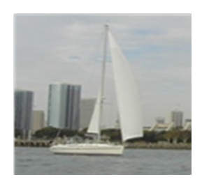
San Diego Bay sailboat

There are approximately 8,400 boat slips in San Diego Bay, 2,400 in Mission Bay, over 1,000 in Oceanside Harbor, and over 1,500 in Dana Point Harbor. In addition to boats with assigned slips, there are several hundred additional boats moored at a variety of "free" anchorages. In San Diego Bay, the San Diego Unified Port District has organized two of its free anchorages into formal anchorages which have shoreside showers, rest rooms, and docking facilities. Boat owners are required to pay fees for these services. In 1986, the San Diego Unified Port District was granted permission by the Coast Guard to establish additional formal anchorages in San Diego Bay. Because of the reluctance of some boat owners to pay fees for mooring in the bay, many have elected to move their boats to new free anchorages. Such anchorages can be especially important sources of human pathogens from vessel sewage releases. In addition to the vessels normally maintained in the water, there are several thousand additional "trailer" boats using San Diego's boat harbors. In total, approximately 55,000 vessels are registered in San Diego County.