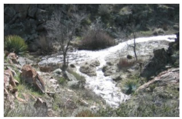
Noble Canyon Creek

Riparian and stream habitats provide natural beauty which is appreciated and valued by people. Riparian and stream habitats, especially in urban areas, are vital to enhancing our quality of life. People are far more likely to respect and be stewards of "natural" reaches of streams than channelized or artificially modified reaches. Riparian lands represent a significant value to society.