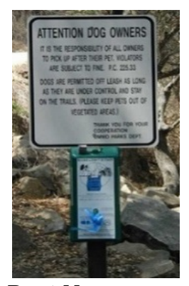
Best Management Practices

The permit objective is achieved by way of pollution prevention. To eliminate pollutants in storm water, one can either clean it up by removing pollutants or prevent it from becoming polluted in the first place. Because of the overwhelming volume of storm water and the enormous costs associated with pollutant removal, pollution prevention is the only approach that makes sense. Pollution prevention which means stopping the generation of pollution at its source by reducing the use of products containing pollutants, is in fact, the basis of the entire storm water program. Once pollutants have been generated, pollution control best management practices (BMPs) must be employed to prevent the existing pollution from coming into contact with the water of the State. It is important to point out that this approach is distinctly different from the conventional end-of-pipe treatment approach commonly used in water quality regulation.