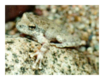
California tree frog

Section 404 of the Clean Water Act requires the USEPA, in conjunction with the USACOE, to promulgate guidelines for the discharge of dredged or other fill material to ensure that such proposed discharge will not result in unacceptable adverse environmental impacts to waters of the United States. Section 404 assigns to the USACOE the responsibility for authorizing all such proposed discharges, and requires application of the guidelines in assessing the environmental acceptability of the proposed action. The USACOE and the USEPA also have authority under section 230.80 to specify, in advance, sites that are either suitable or unsuitable for the discharge of dredged or fill material in US waters. In addition, Clean Water Act section 401 provides the States a certification role as to project compliance with applicable water quality standards.