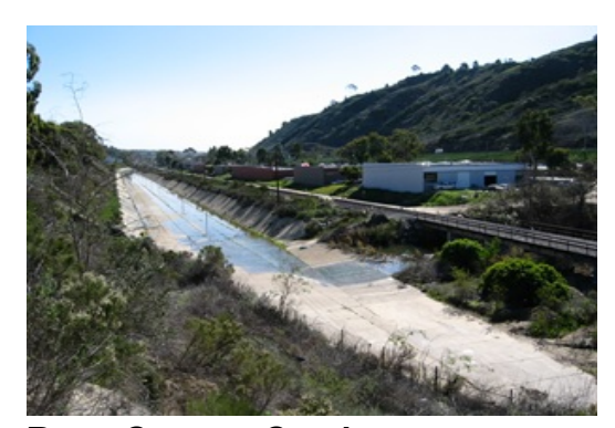
Rose Canyon Creek

Today, many flood plains have been channelized to protect property. There are a variety of channel designs which have been built. Channel designs vary in range from completely natural to entirely concrete lined with concrete bottoms. Other channel types include natural channels modified to contain a low-flow channel with or without side filling or riprap or concrete; and with or without encroachment by agriculture and/or urban areas.