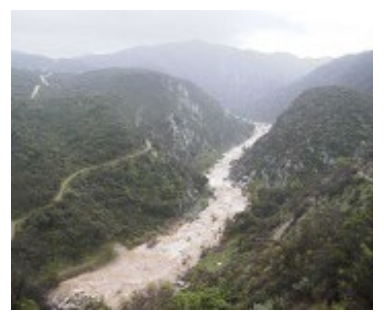
Santa Margarita River