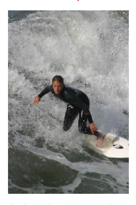
Surfer at Ocean Beach, San Diego County

In addition, the fecal coliform concentration shall not exceed 400 organisms per 100 ml for more than 10 percent of the total samples during any 30-day period.