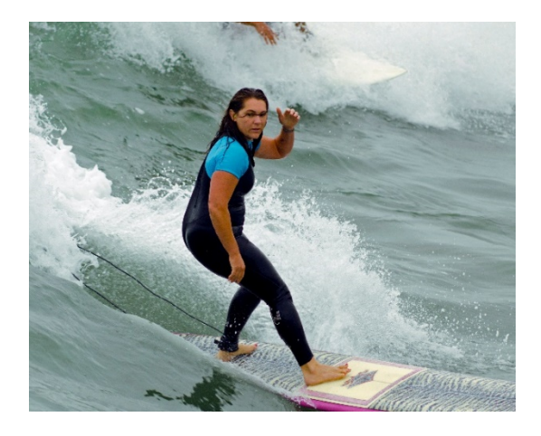
Surfer at Ocean Beach, San Diego County