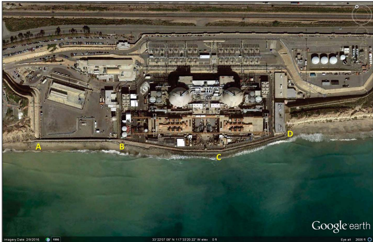
Figure 3. The public beach walkway is situated along the southwest perimeter of San Onofre Nuclear Generating Station, sections of which are denoted by letters A through D. The North Industrial Area walkway comprises sections A (upcoast entrance of walkway) to B. Section B marks the beginning of the Units 2/3 walkway and ends at D. Section C is the area of highest need of riprap repair.