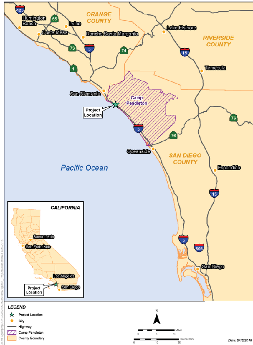
Figure 2. Location of the San Onofre Nuclear Generating Station in San Diego County. The proposed project would occur on the beach in front of the seawall bordering the southwest perimeter of the plant.