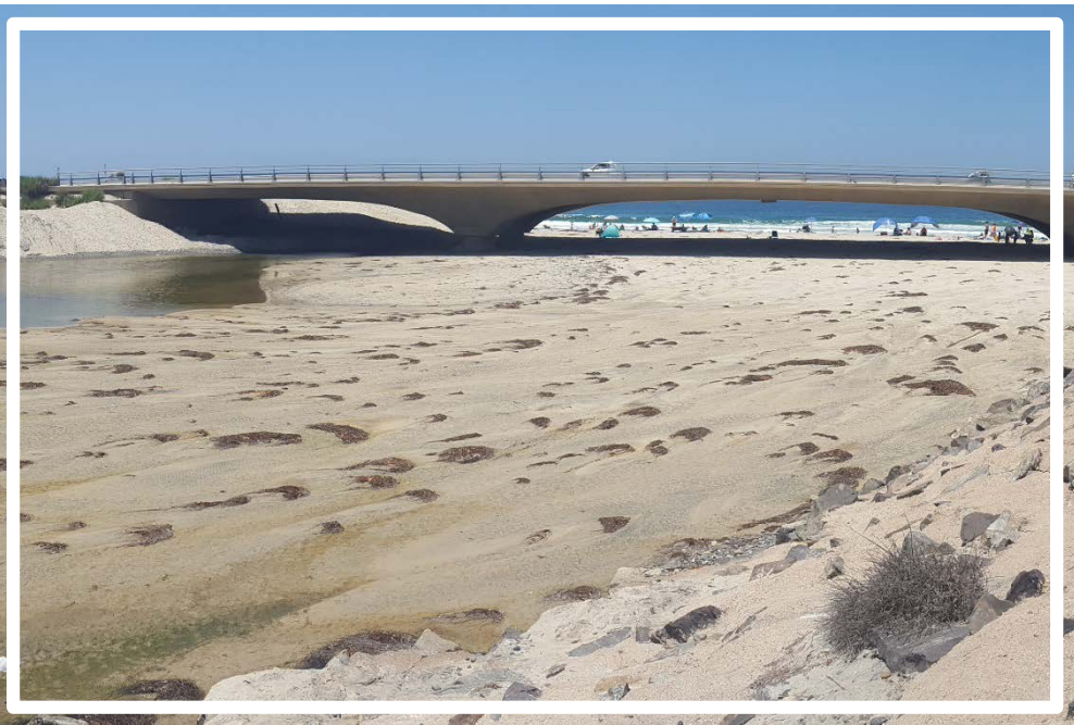
- Los Peñasquitos Lagoon -