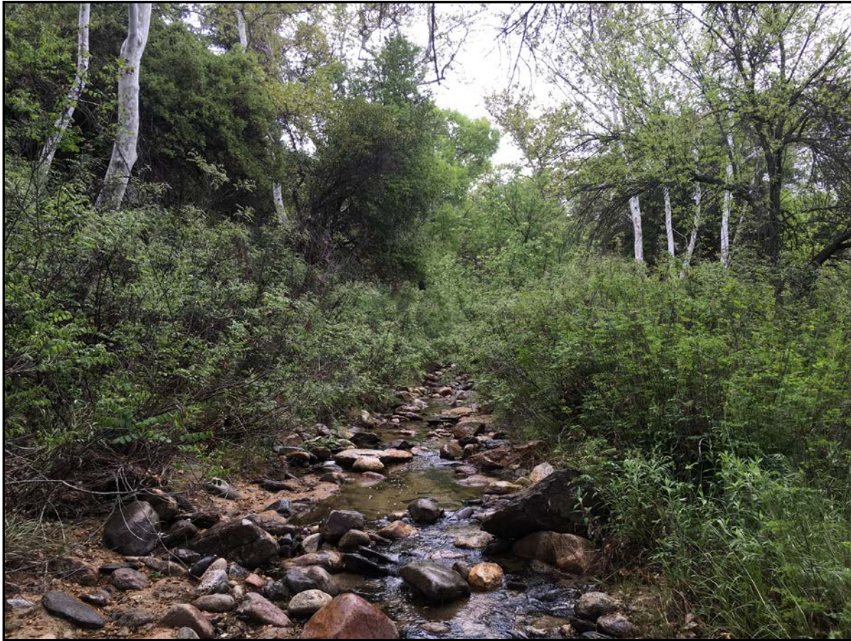
Figure 1. Category 1 Waterbody: Upper Agua Caliente Creek