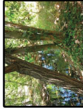
EXISTING SITE PHOTOS