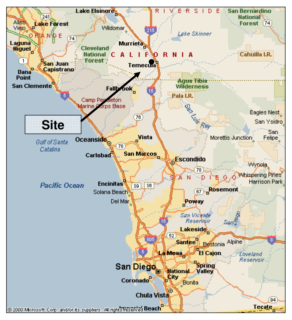
FIGURE 1 Eastern Municipal Water District Sanitary Sewer Overflow

Site Address 28079 Diaz Road, Temecula WDID No. 9 000000763