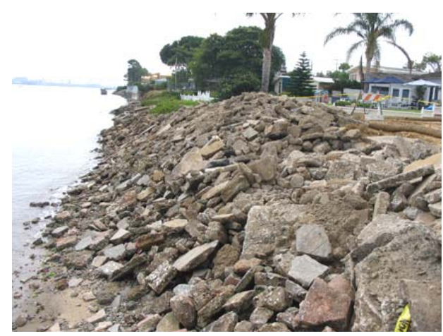
Figure 1. Pre-Construction condition of shoreline