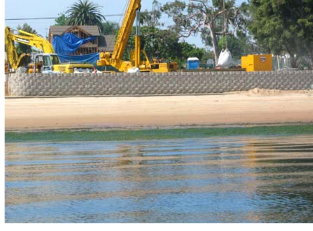
Figure 2. Post construction shoreline condition, with un-permitted seawall construction, and discharge of fill material (beach sand)