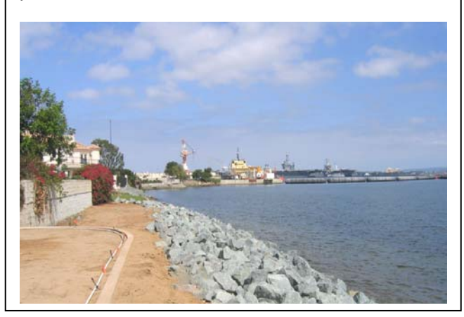
Figure 7. Concrete footing encroaches over MHTL by approx. 1-foot for the entire length of the wall, per Port survey.

Figure 5. Photo looking north at the City of Coronado shoreline protection project (05C-067) which is how the project at 501 1<sup>st</sup> Street was permitted to be constructed.